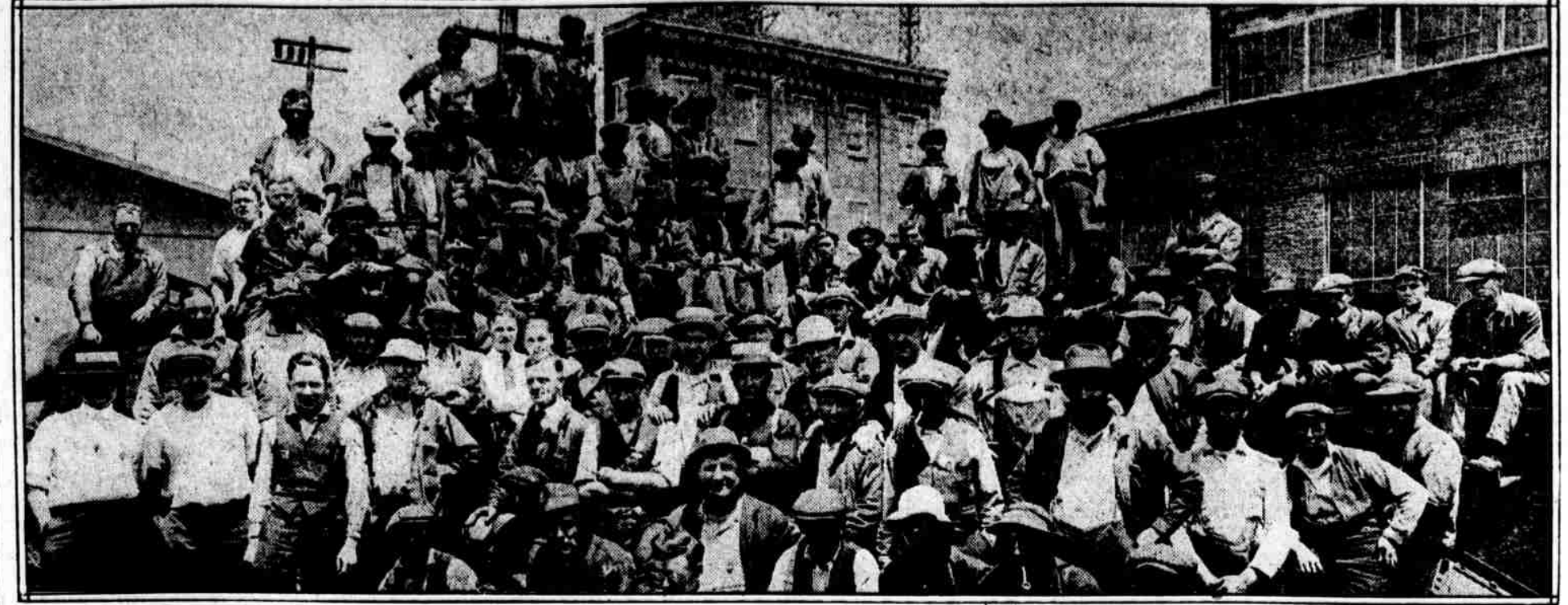
When these men get their "boys" going full speed on the shipways at Chester you can bet the Kaiser can hear

FOREMEN OF RIVETERS, CHIPPERS AND CAULKERS AT CHESTER SHIPBUILDING CO.'S PLANT