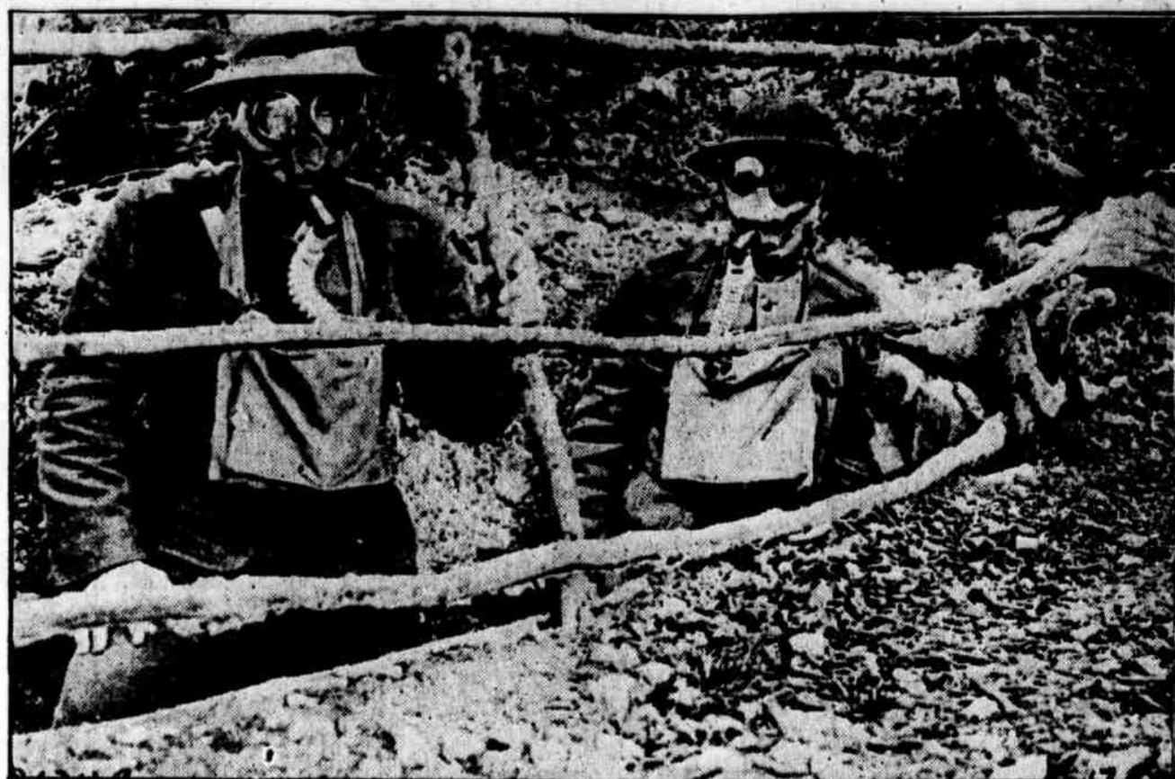
AS AN ATTACK OR SO comes all in the day's work for the marines who are helping make life miserable for the Germans opposing them. The lads are prepared for a German attempt to "strafe" them.