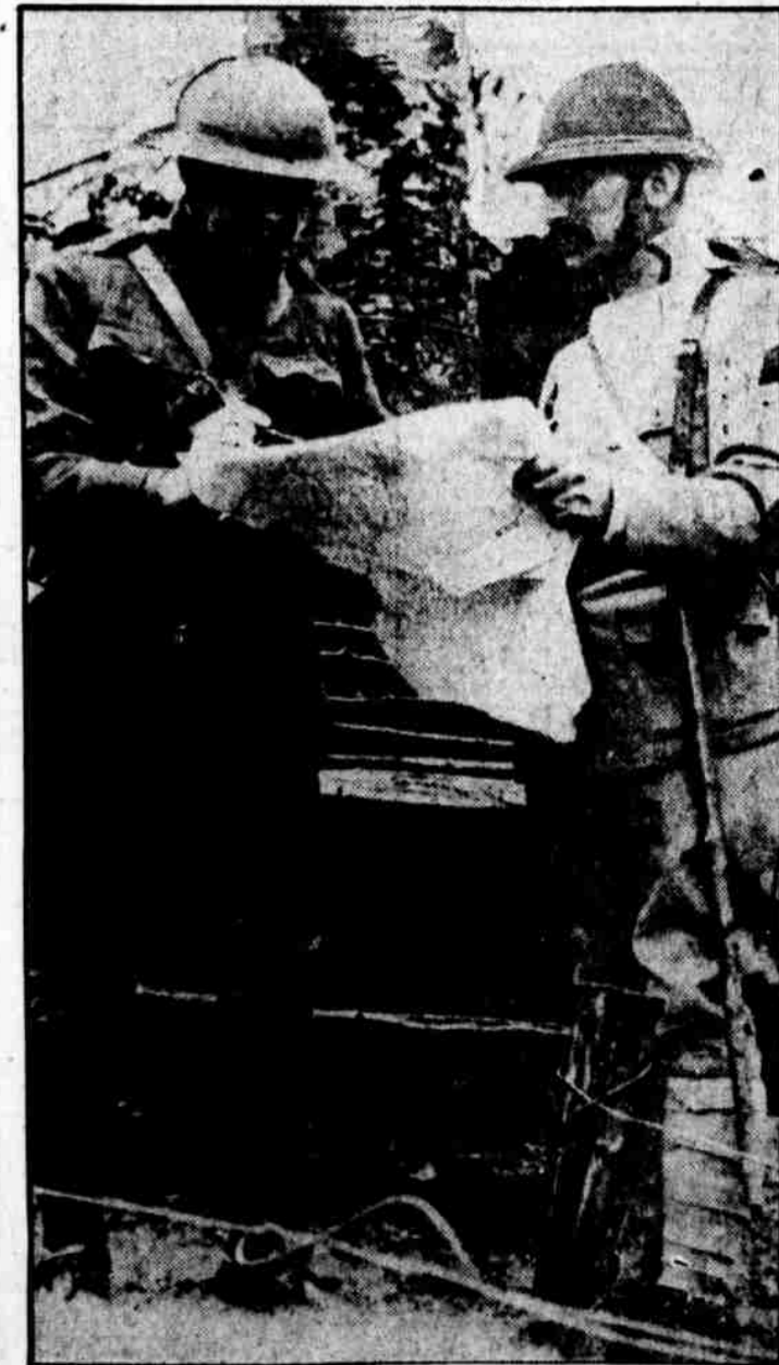
AMERICAN AND FRENCH colonels studying a war map.