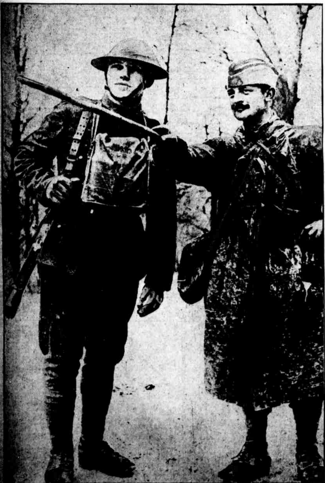
EXPLICIT DIRECTIONS are given to a marine by his poilu comrade.