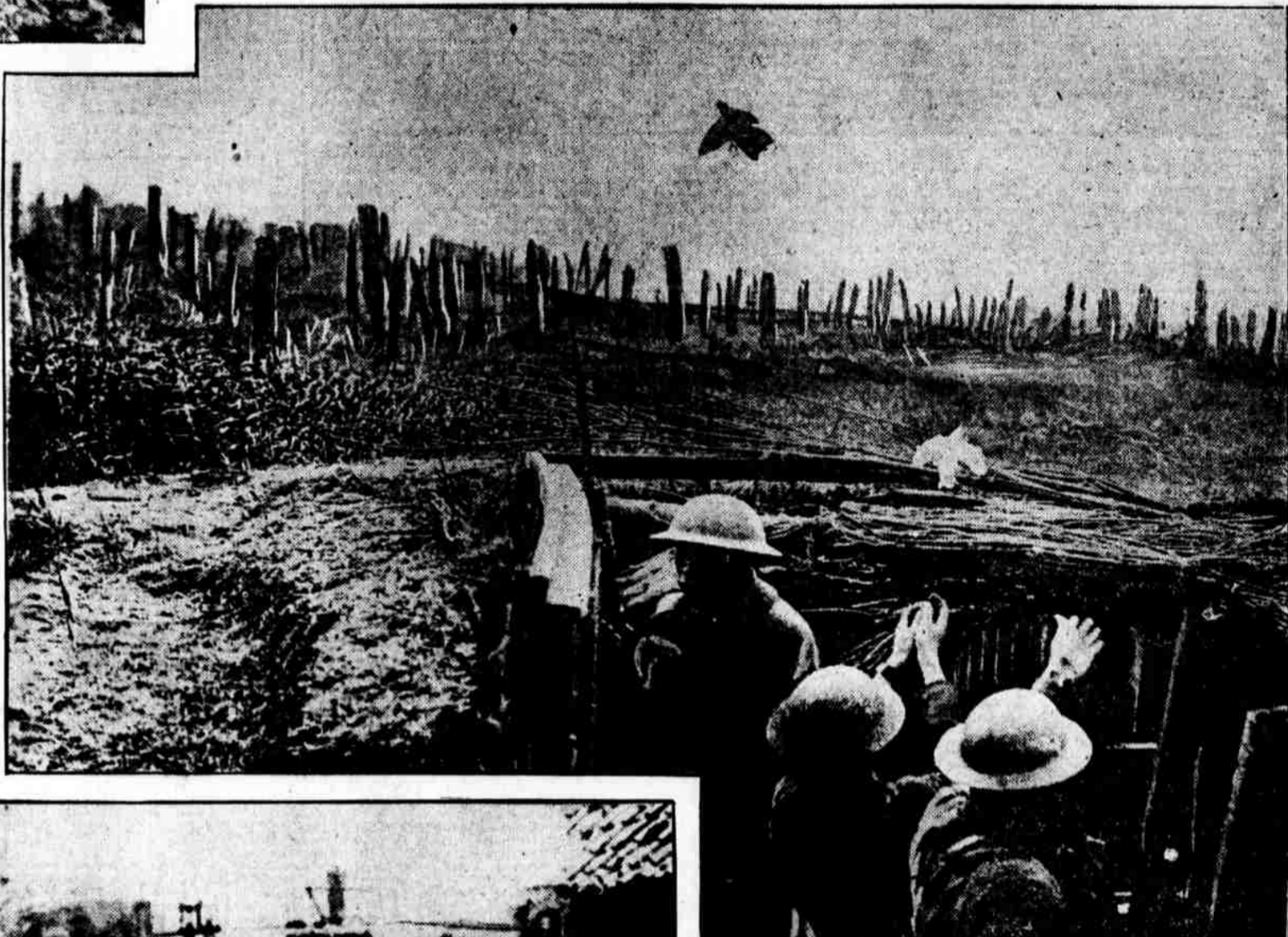
UNCLE SAM HAS ENLISTED many carrier pigeons in his overseas army, and to say that the birds make good messengers is to put things mildly. Above—Americans in a front-line trench releasing a pigeon with a code message for headquarters.