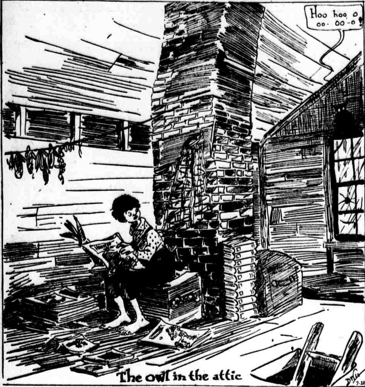
The owl in the attic

Hue Determined He (at dance)—What beautiful Syracuse hair you have! She—What kind is that? He—About fifty miles from Auburn.—Cornell Widow.