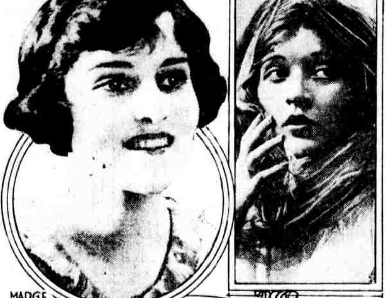
MADGE KENNEDY in "THE SERVICE STAR" at Stanley