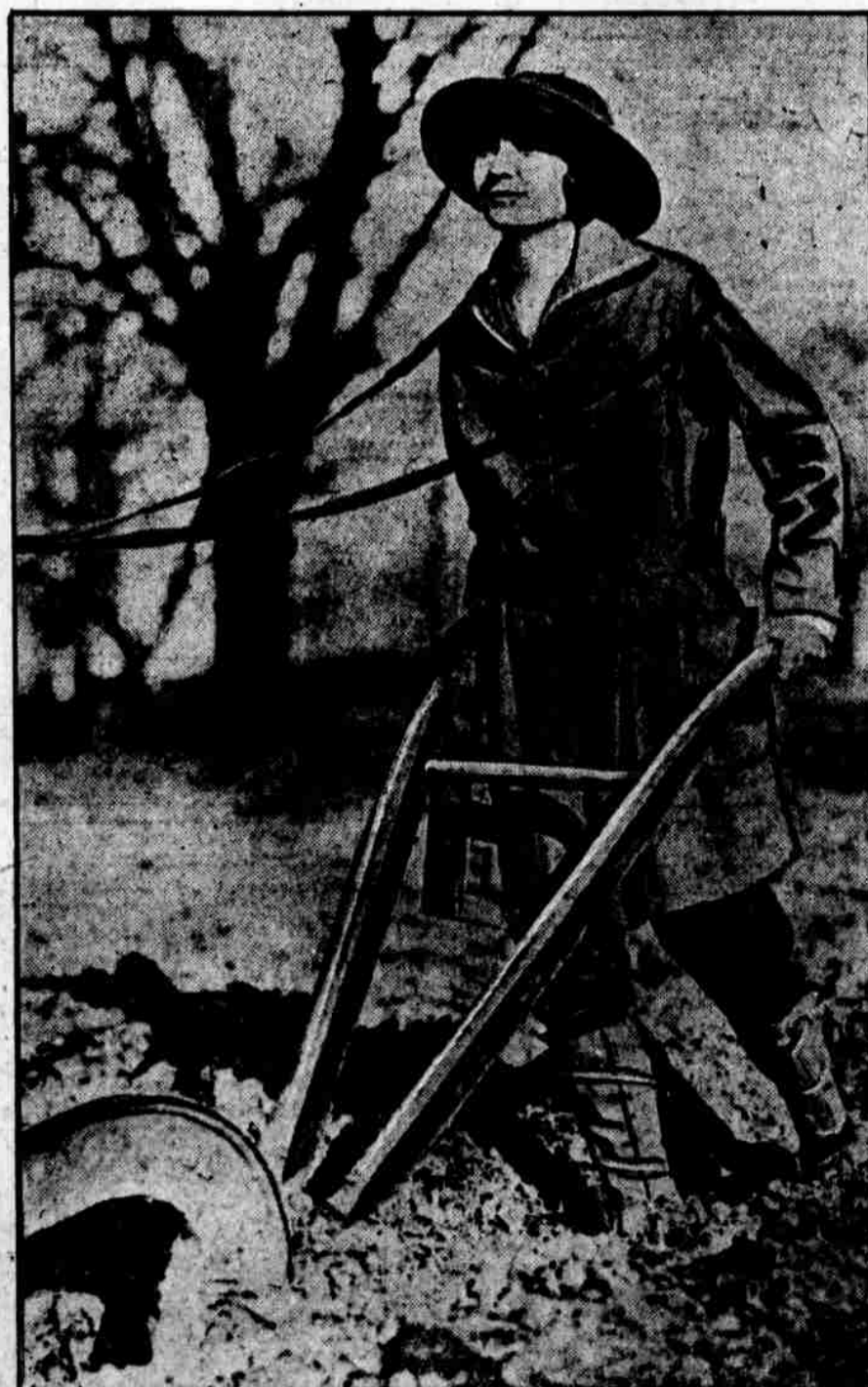
FOR FARMERETTES this charming and practical suit of khaki-colored crash makes the ideal costume. The short coat with trousers and canvas puttees makes it particularly serviceable.