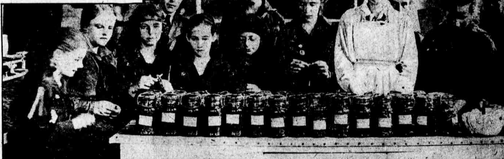
THE COLD, HARD WINTER will not be so hard this year now that the Girl Scouts at the Radnor High School have "put up" some 200 quarts of good things to eat.