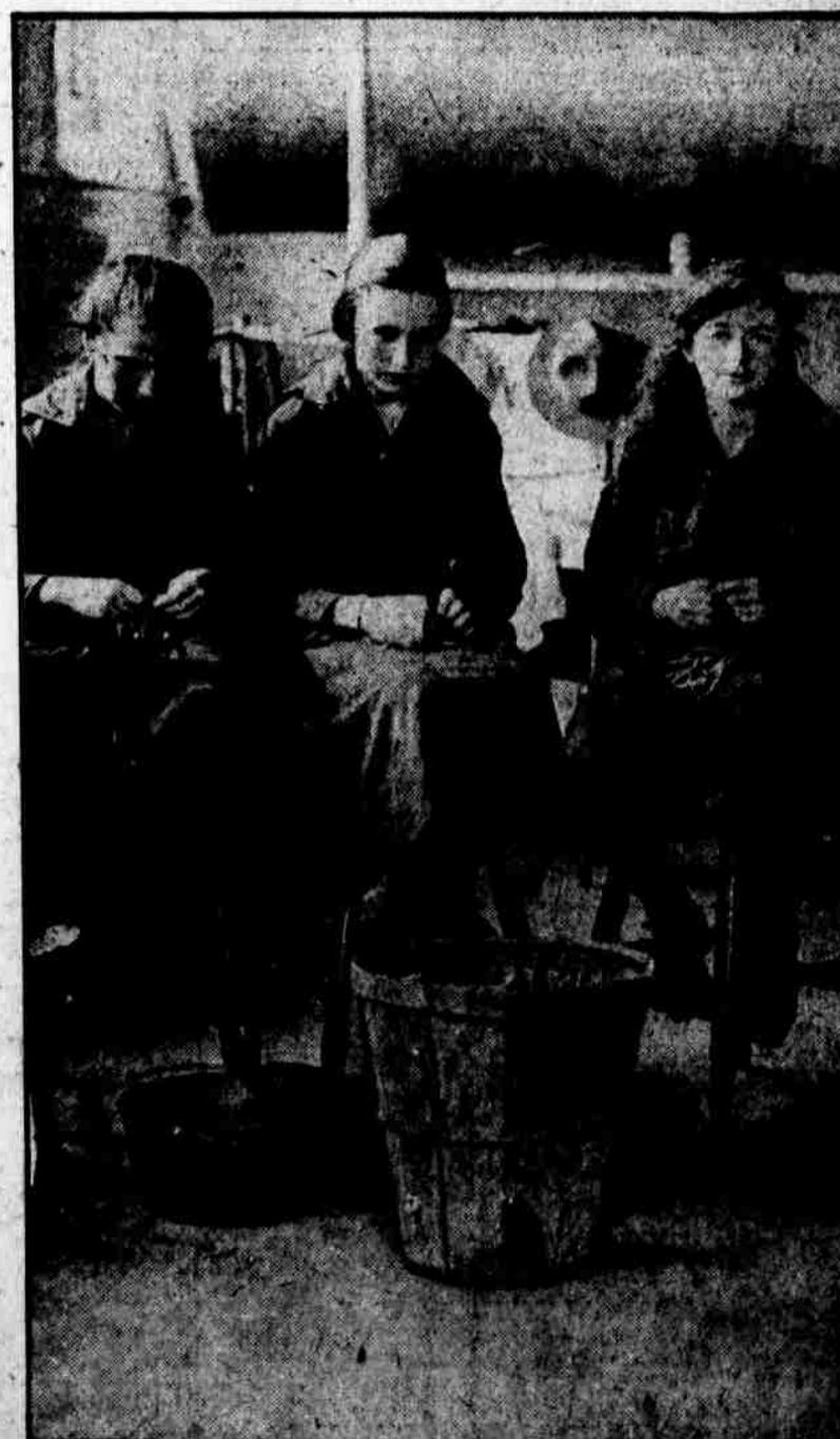
BEFORE YOU CAN "put up" vegetables and fruits for the winter, the things must first be prepared. These Red Cross Girls are going over some of the things.