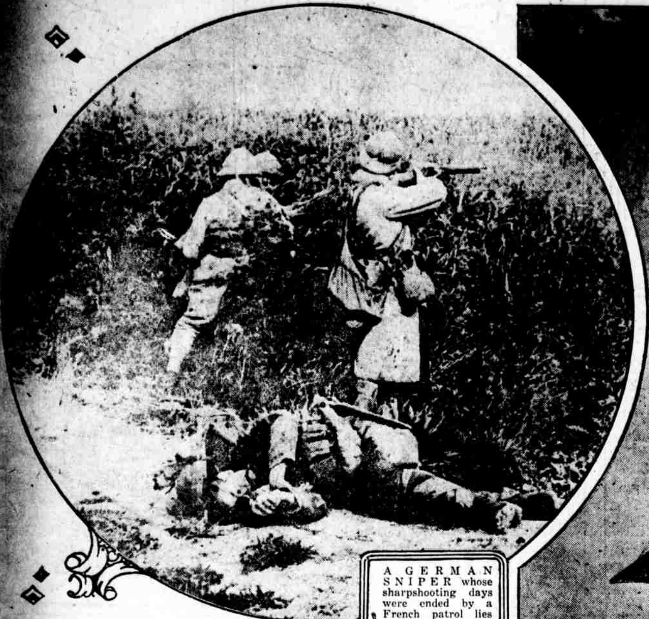
A GERMAN SNIPER whose sharpshooting days were ended by a French patrol lies where he fell while the poilus continued their hunt for more of the foe.

REMARKABLE CLOSE-UP VIEW OF A BATTLEPLANE IN FLIGHT HERE—THE DAY'S NEWS IN PICTURES