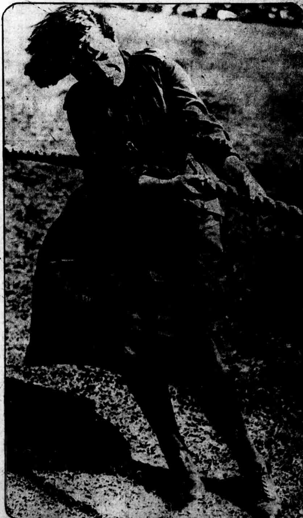
INDICATIVE OF THE "PEP" possessed by the "Tommy Waack" is the determination with which this young woman entered into the war-of-war during field-day work of the British women in France.