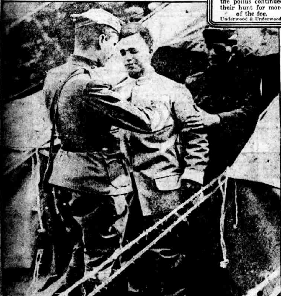
GASSED BY A GERMAN poison wave, this Yankee soldier is glad to find himself in the hands of American doctors at a first-aid tent behind the lines.