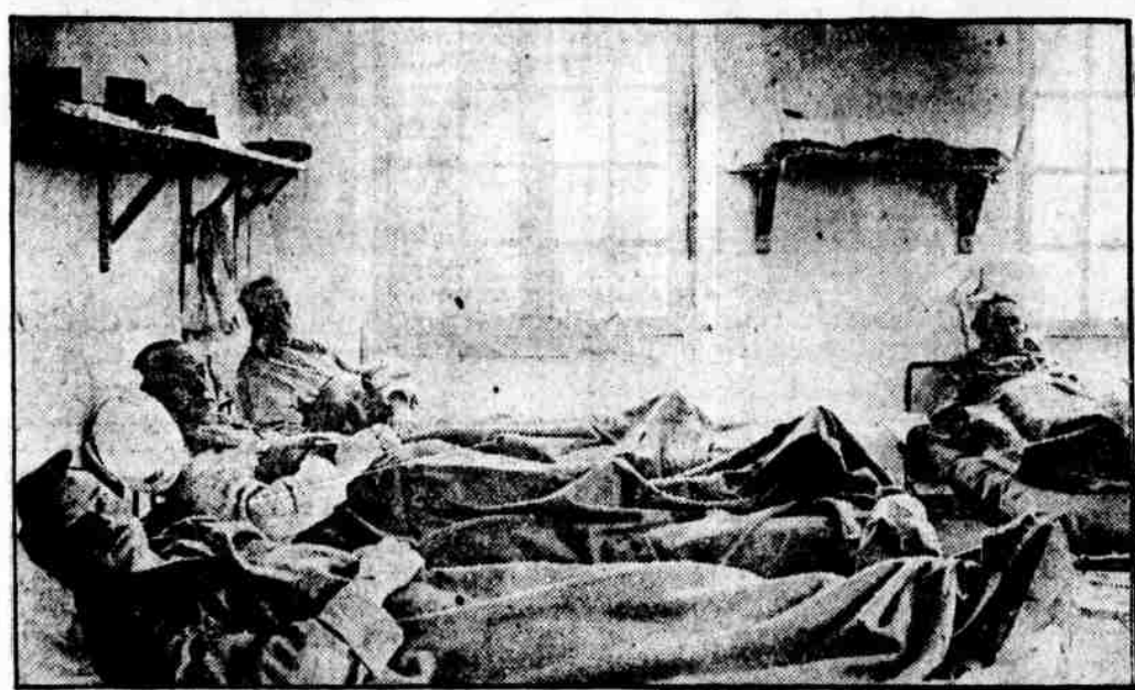
AMONG THE FIRST of our soldiers to fall wounded, these American soldiers are nearing the end of their long confinement at a base hospital overseas.