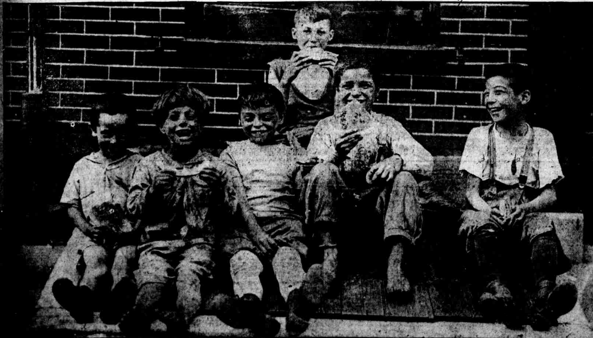
WARS MAY COME and wars may go, but the kids' love for watermelon is undying.