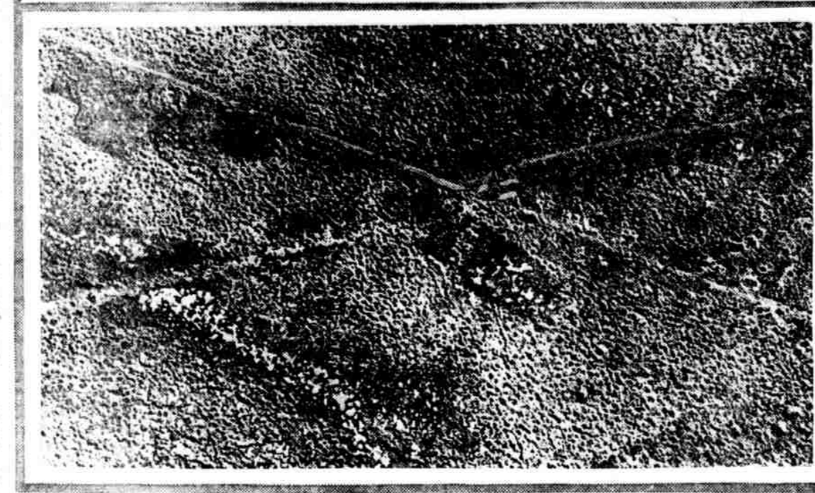
These remarkable photographs show the result of a two days' bombardment by British big guns of the town of Zombelke, where the Germans had put up a supply station. The British got the range of the cross-roads, where huge warehouses and railroad tracks, with trains, were located, and bombarded them with such deadly accuracy that they were completely blotted out. Shells were fired over all portions of the town at the rate of 200 per minute throughout two days and a night until every foot of ground was devastated.