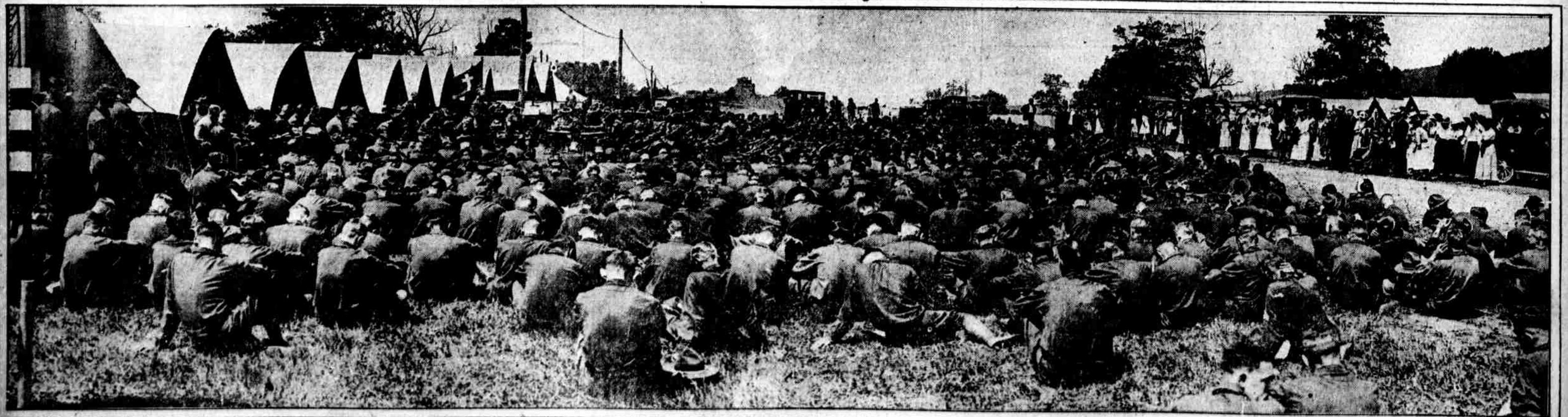
THESE REVERENTLY BOWED HEADS mutely, but eloquently, attest the fact that the Sunday religious service conducted by the chaplain is a vital part of the life at Camp Stewart.