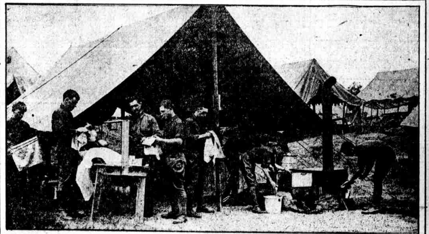
A "HUNDRED PER CENT KITCHEN" is the proud boast of these boys from Swarthmore and Media, who are seen doing the culinary honors for Company H, First Infantry.