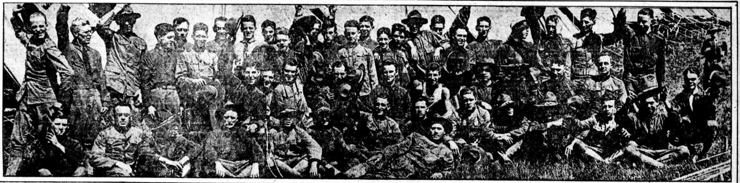
EVERYBODY LOOKS PLEASANT in Company C, First Infantry, when the EVENING PUBLIC LEDGER staff photographer gives the signal.