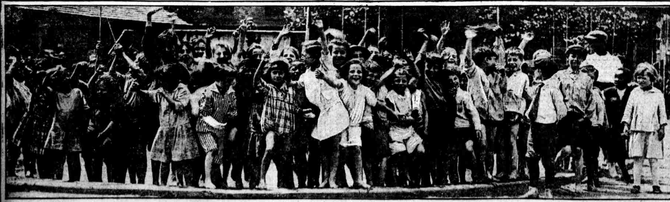
THE DELIGHT OF DELIGHTS for the kiddies in summer is the wading pool or necessarily not even a regulation pool, just so there's wading. Down at the Starr Garden Recreation Center the neighborhood youngsters are on hand daily for the cooling sport, as illustrated by the photographs above.