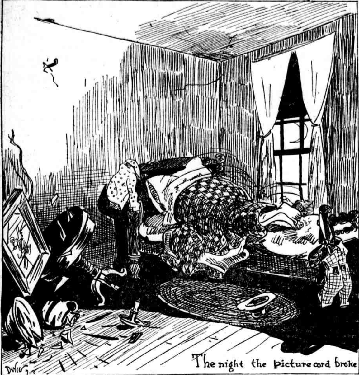
The night the picture cord broke

The Orchestra I've noticed often at the play Among the other great surprises The orchestra will fade away The moment that the curtain rises. But when the play is done, why, then, The orchestra comes back again. And so it is at winter's show (You may have asked yourself the reason) The orchestra of birds will go When they have ushered in the season. But when the season's over—then The orchestra comes back again. —Grif Alexander.