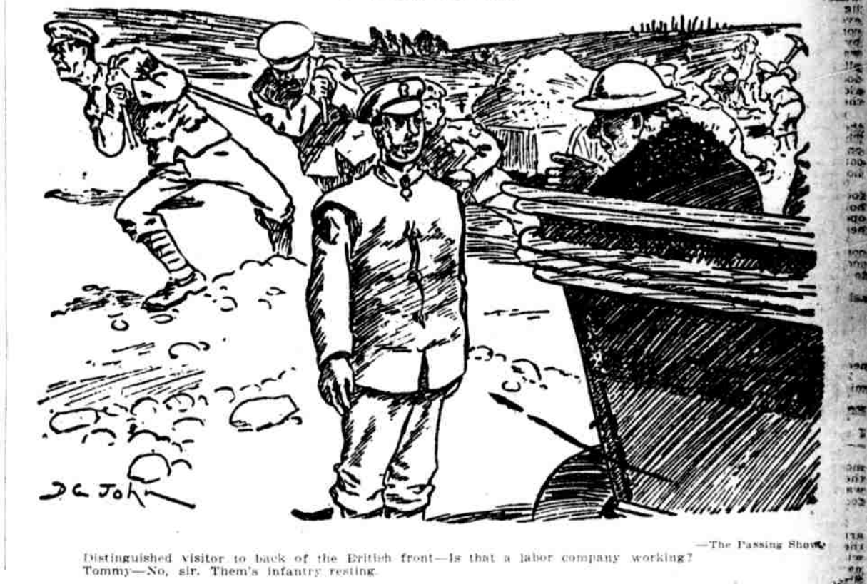
Distinguished visitor to back of the British front—Is that a labor company working? Tommy—No, sir. Them's Infantry resting.