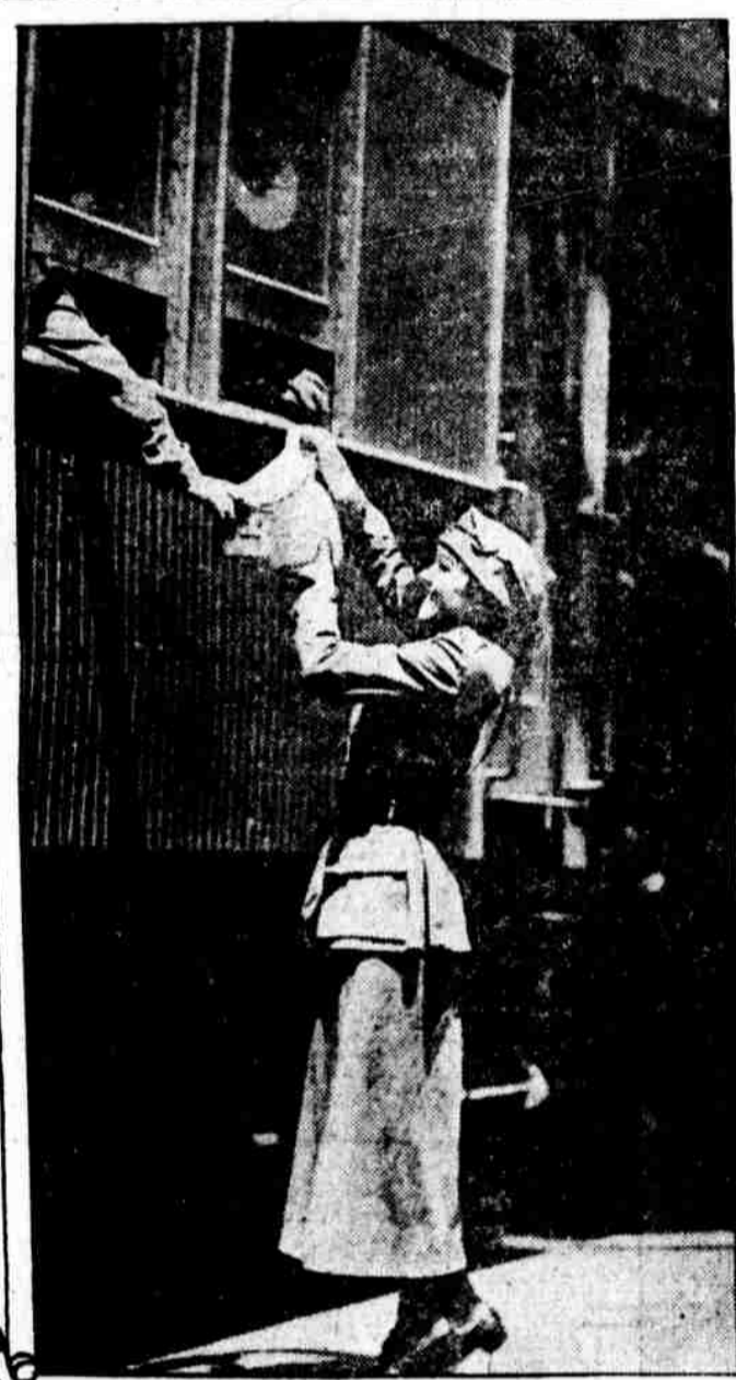
A TOOTHsome SANDWICH or a drink of refreshing lemonade awaits each soldier who extends his hand or cup from the car window.