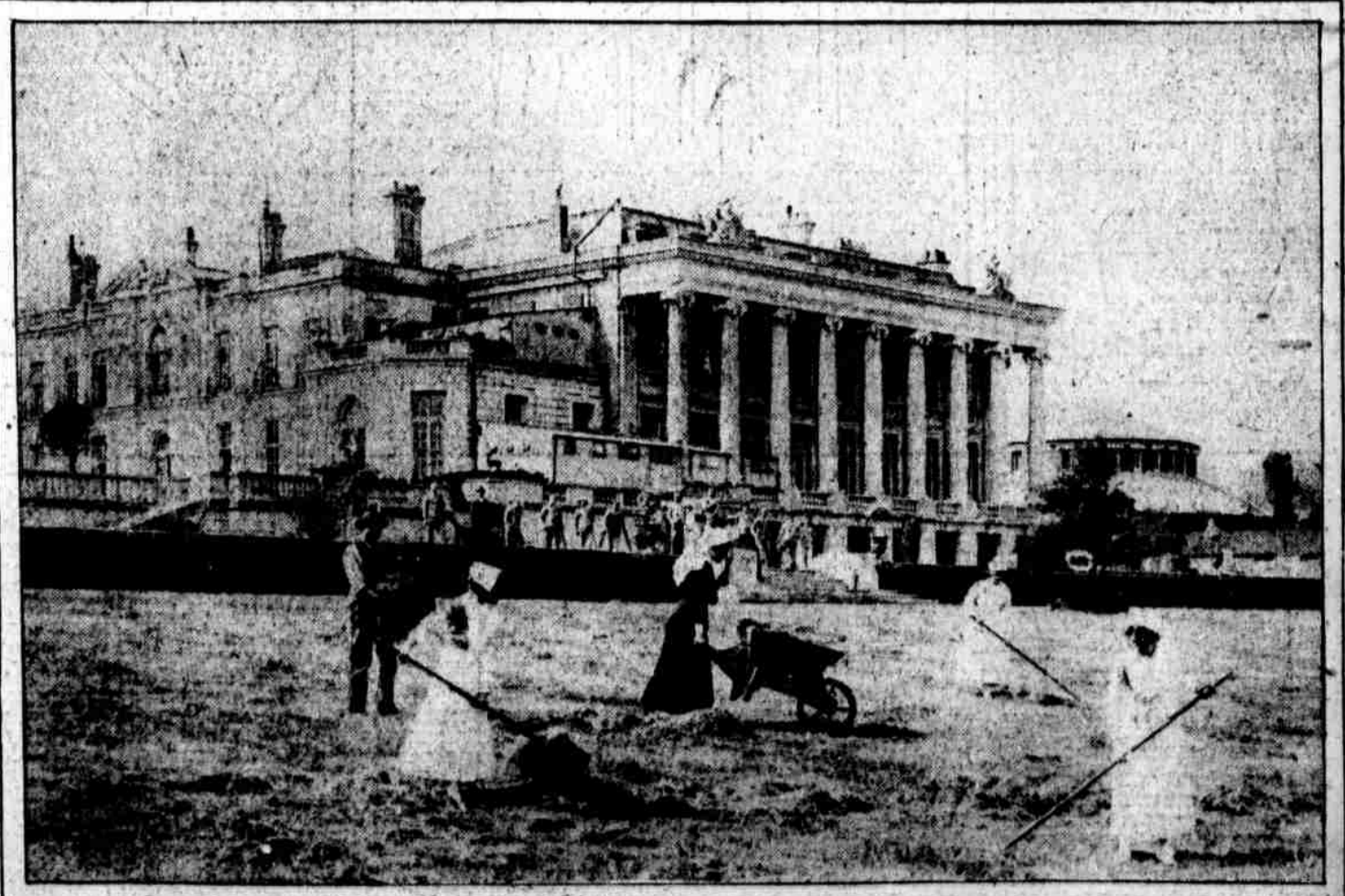
YOUNG AMERICAN NURSES who are caring for wounded Yankee soldiers at the American hospital at Paignton, England, also respond to the scarcity of man-power by mowing the grass on the hospital lawn.