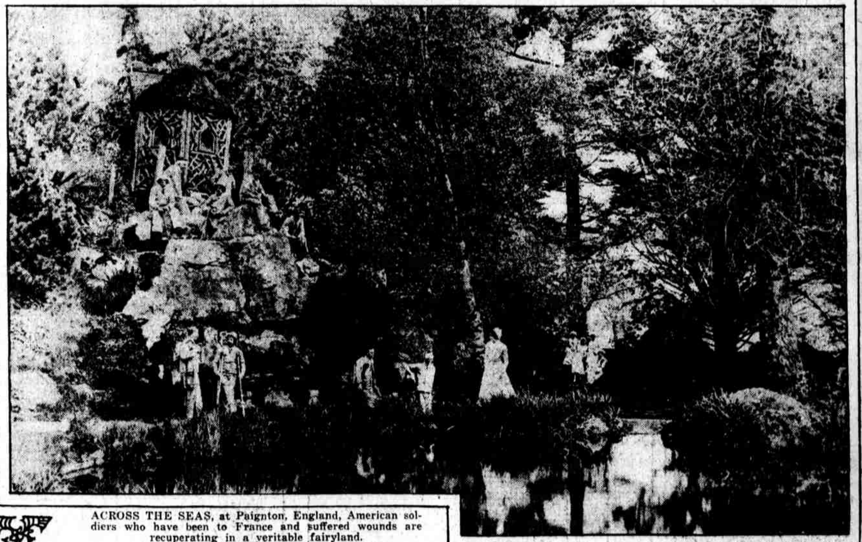
ACROSS THE SEAS, at Paignton, England, American soldiers who have been to France and suffered wounds are recuperating in a veritable fairyland.