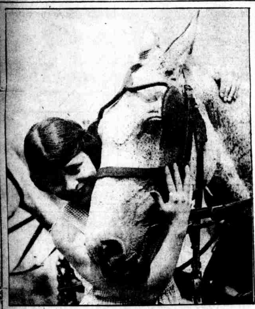
DOBBIN SIGNIFIES his approval of the back-to-the-farm movement for young women by his look of thorough contentment.