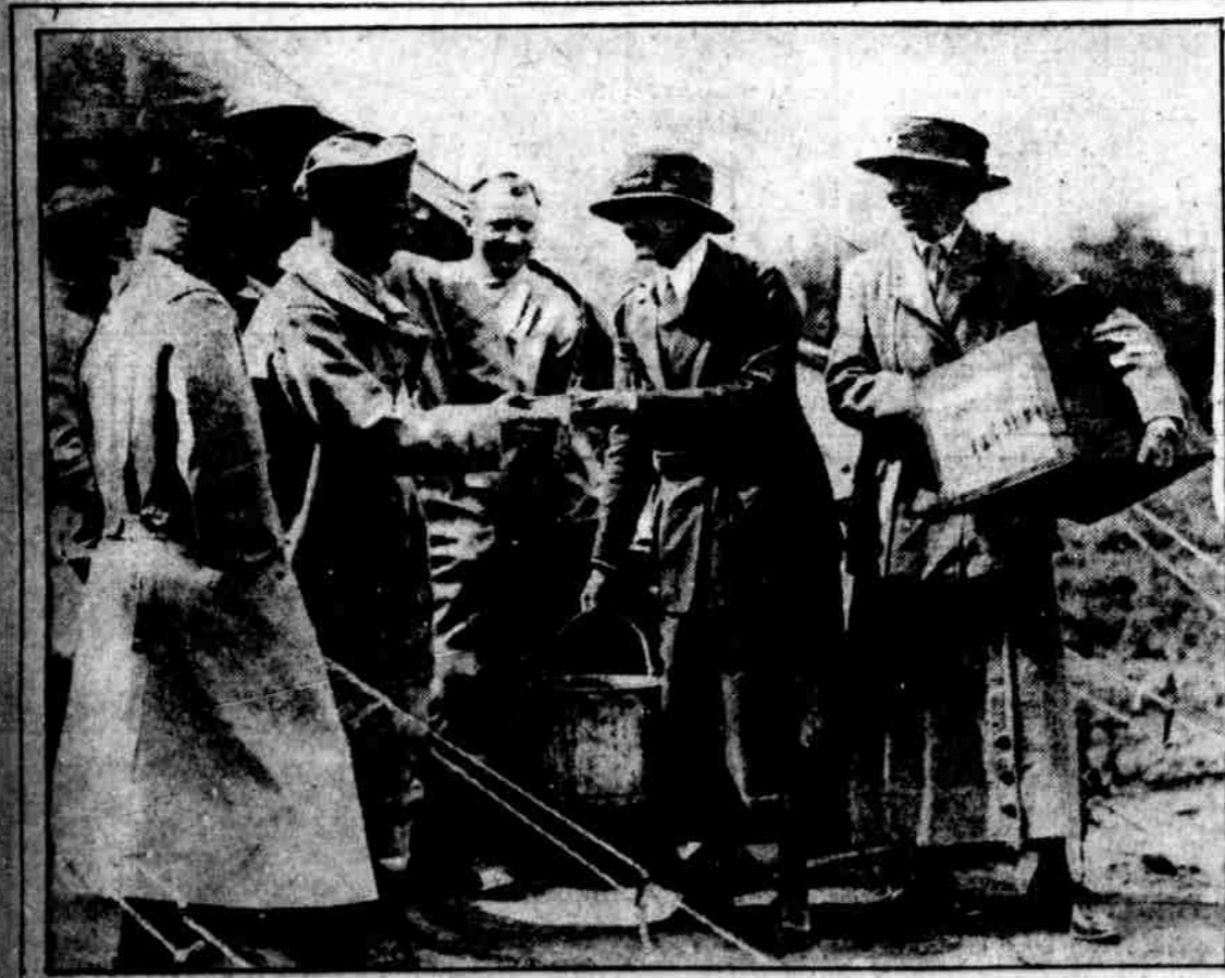
AMERICAN GIRLS "treat" American boys in far-away France. Committee on Public Information