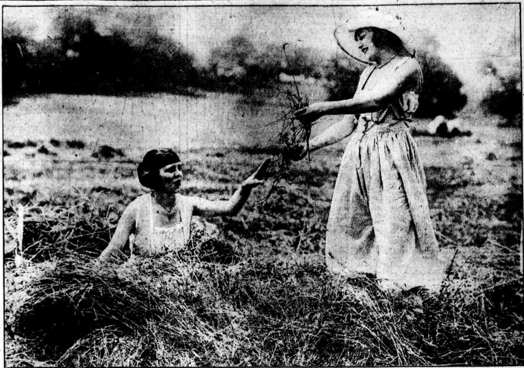
GRACEFUL, FEMIN- INE, modest and useful are adjectives applicable to this newest of garb for farmerettes.