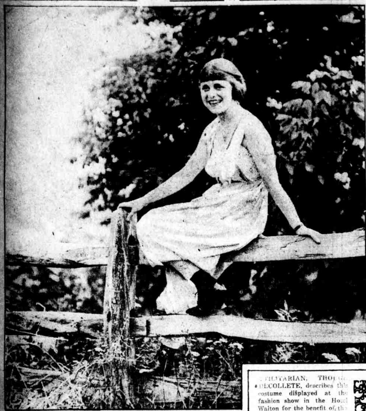
SPRITZLIAN, THOUGH BLOCCOLETE, describes this costume displayed at the fashion show in the Hotel Walton for the benefit of the Navy Recreation Fund.