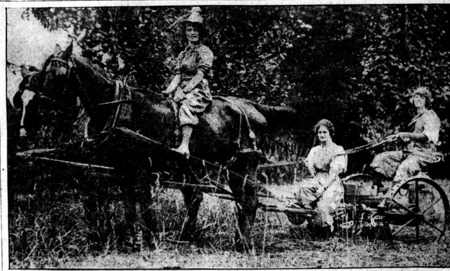
OUT WYNNEWOOD WAY the farmerettes are wont to give greater attention to work and less to costume.