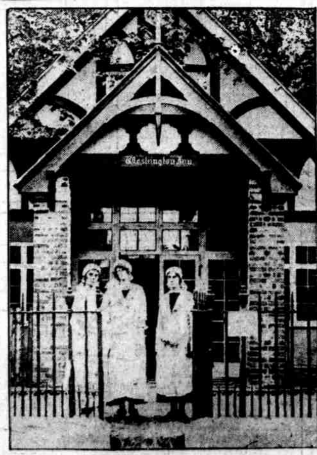
A CORDIAL WELCOME from American hostesses awaits our army officers at their club in St. James Square, London.