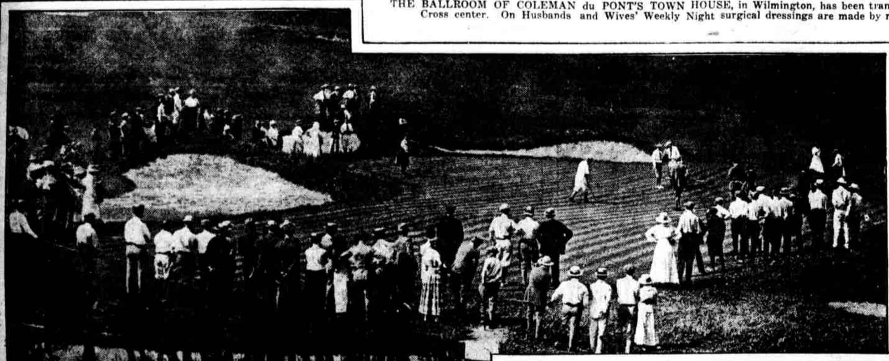
THE RED CROSS GOLF MATCH at Merion, in which Jerome D. Travers and Max Marston played Oswald Kirkby and John Anderson, is here seen at the ninth hole.