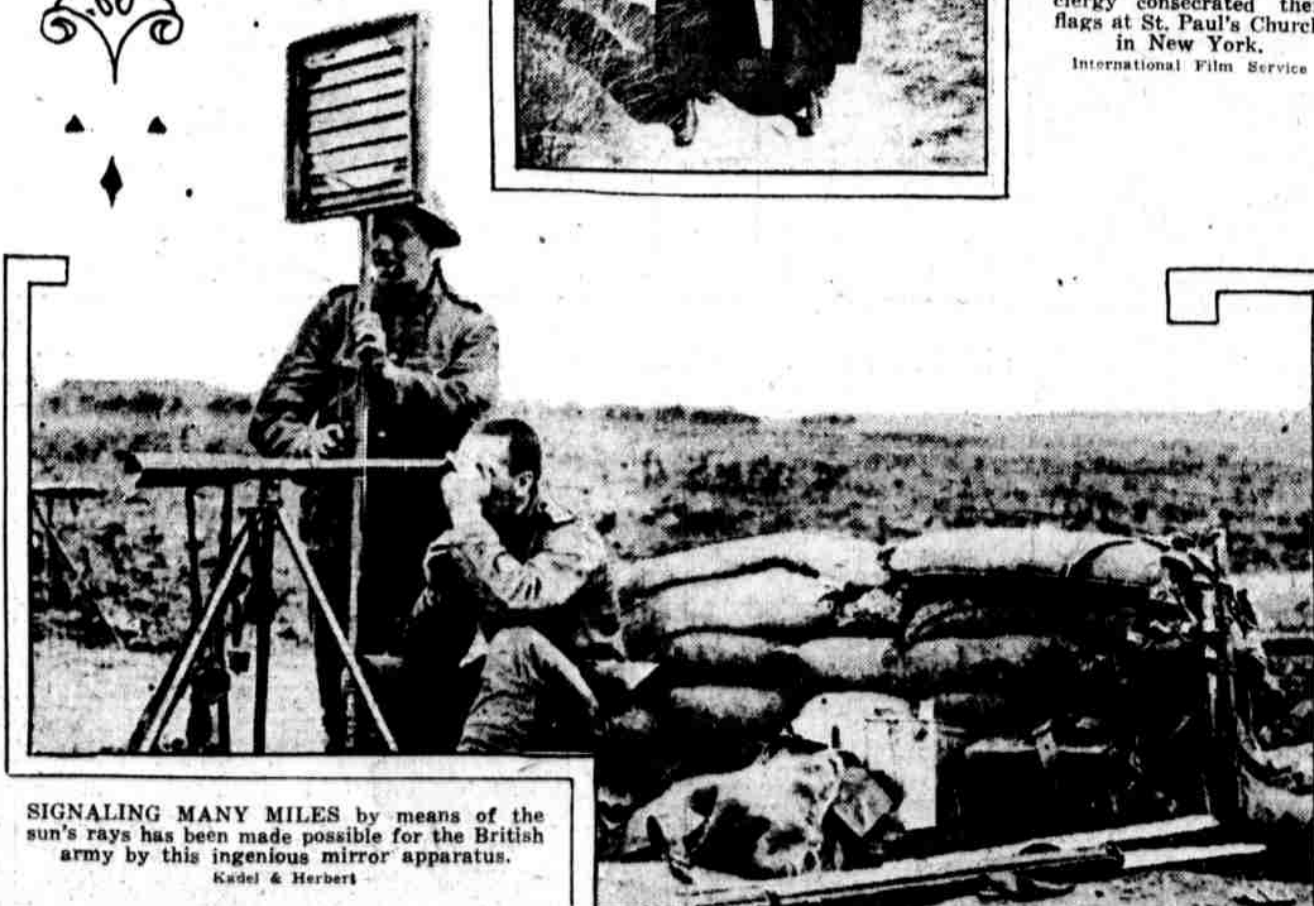
SIGNALING MANY MILES by means of the sun's rays has been made possible for the British army by this ingenious mirror apparatus.