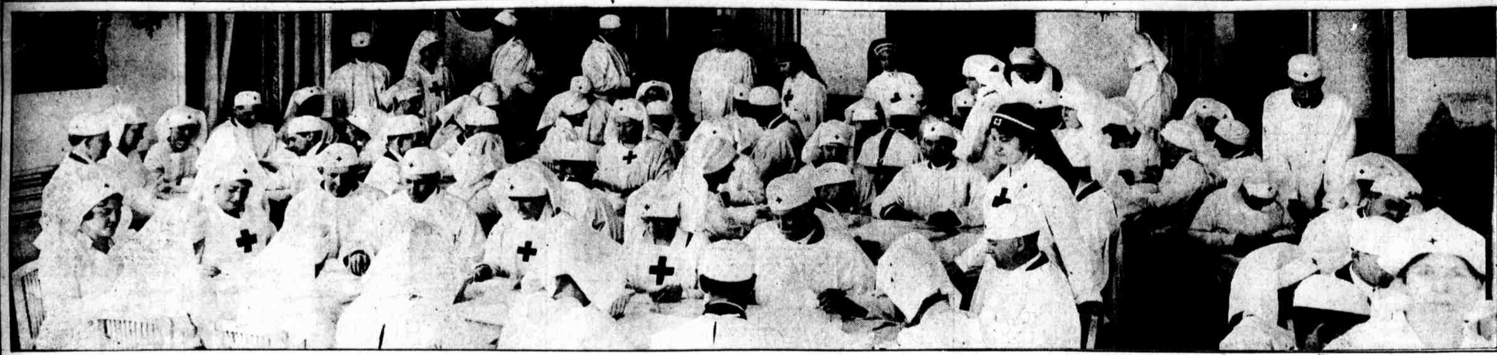
THE BALLROOM OF COLEMAN du PONT'S TOWN HOUSE, in Wilmington, has been transformed into a Red Cross center. On Husbands and Wives' Weekly Night surgical dressings are made by men and women.