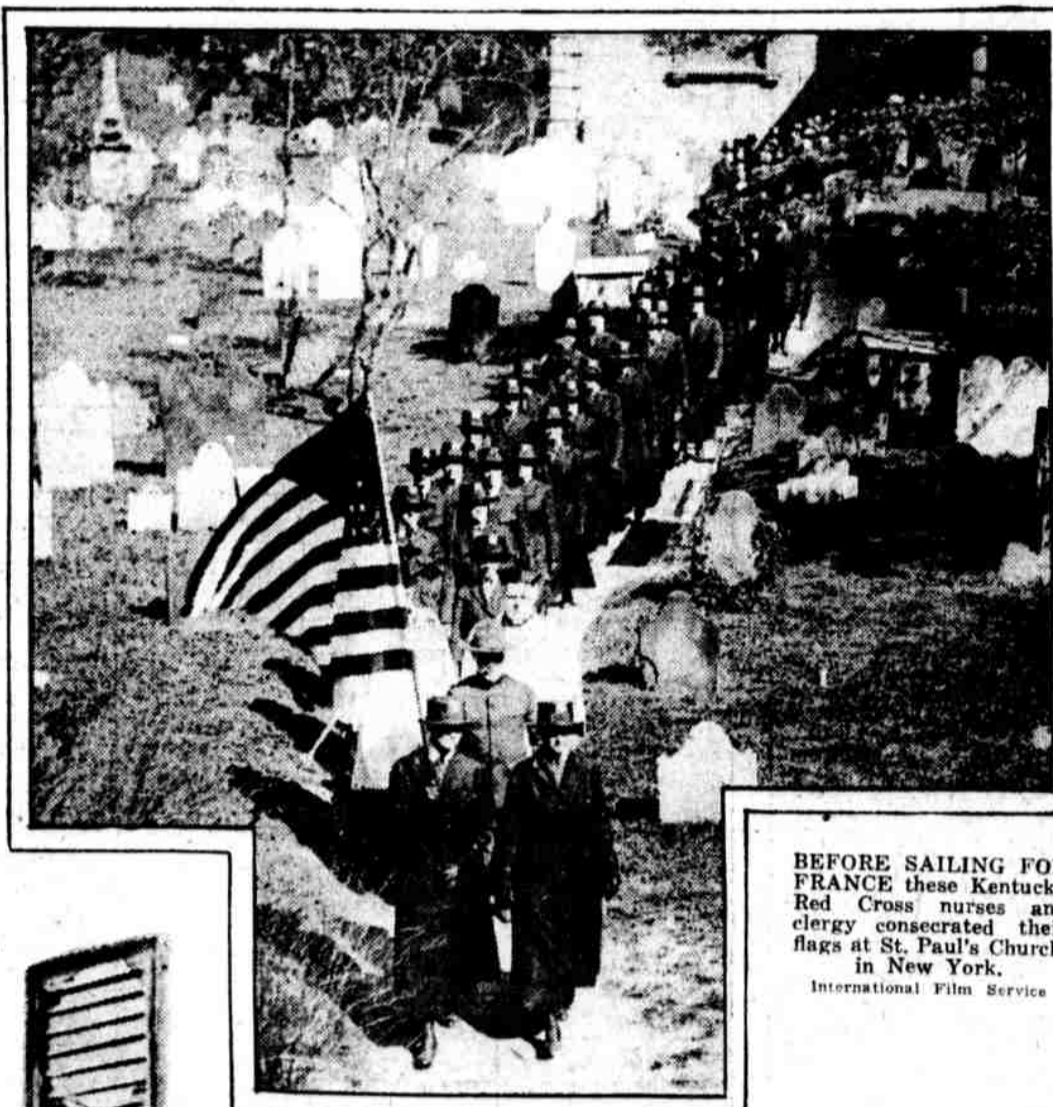
BEFORE SAILING FOR FRANCE these Kentucky Red Cross nurses and clergy consecrated their flags at St. Paul's Church, in New York.