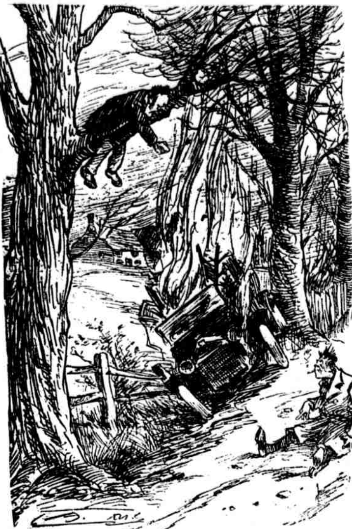
Indignant Owner of Gas-Driven Motor—You blithering idiot! I told you not to smoke. Take a month's notice.