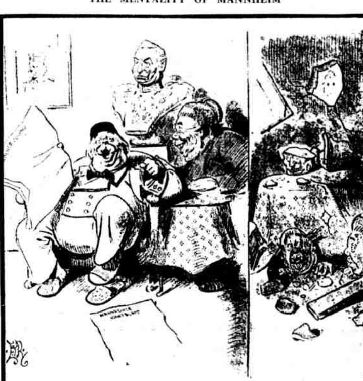
Herr Dummkopf (enjoying the doings of the Götter)—I'm 'er Zees schwein-dogs of English, und geir wifes and children plown all to pieces! Ya, ya, id is untenably a characteristic Cherman-humor-piece. The Same (When the Royal Air Force is overhead)—Gott in Himmel! Zees eff-minded prutes—to go drobbing bombs on innocent peoples! Id is absolute murder. Vat is ze goot of ze "Geneva Convention" if such adrocties are bermitted?