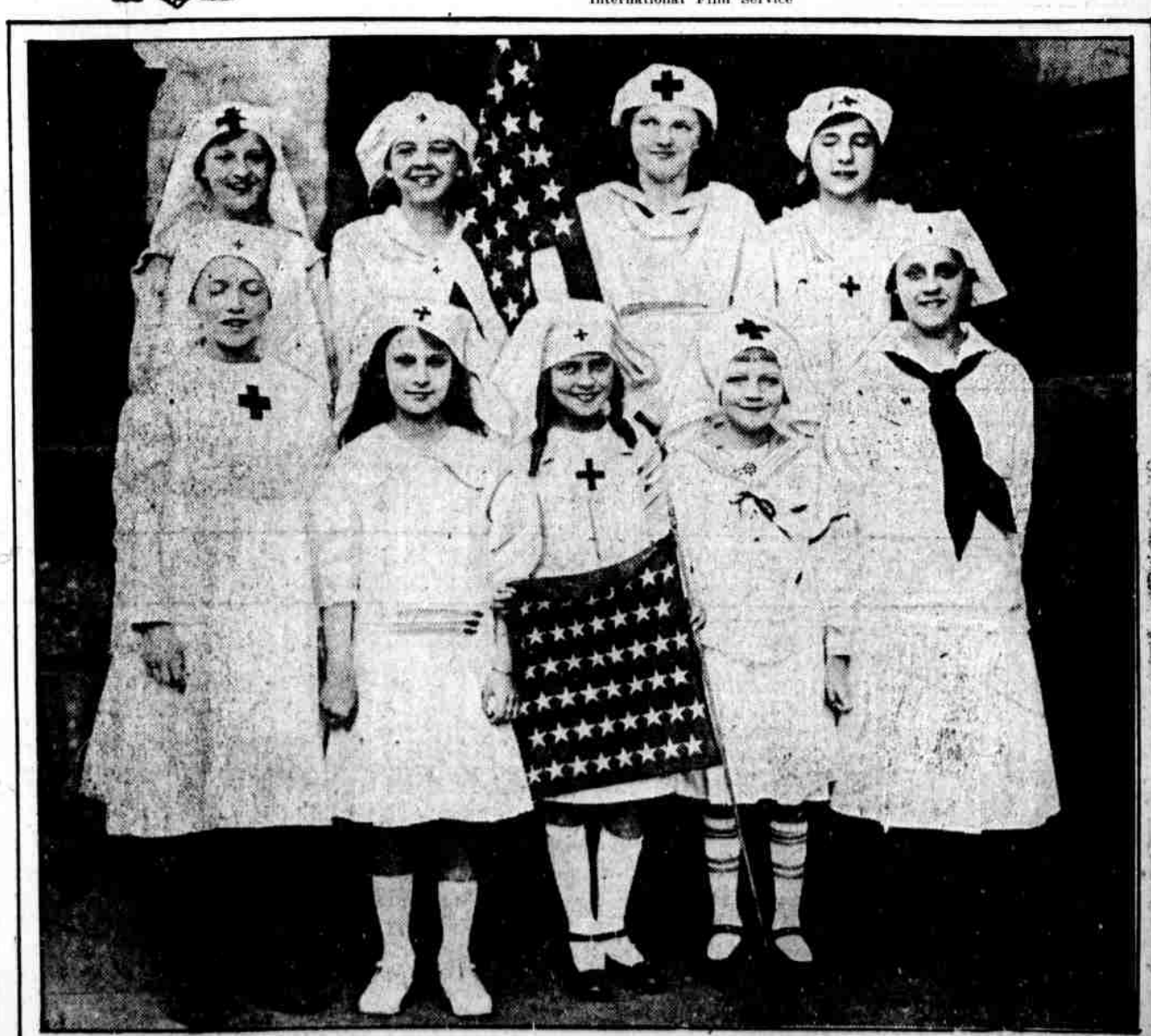
DILIGENT WORKERS for the Red Cross are these youngsters, who realized the sum of $35 from a fete in the square at Twenty-fourth and Wharton streets.