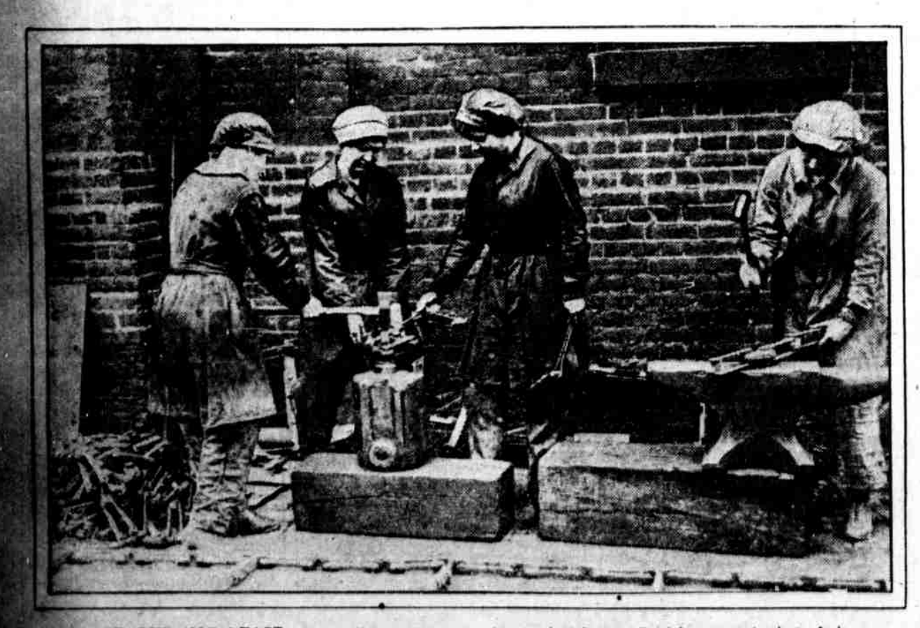
LAST, BUT NOT LEAST, among the many occupations undertaken by British women is that of rivering conveyor chains.