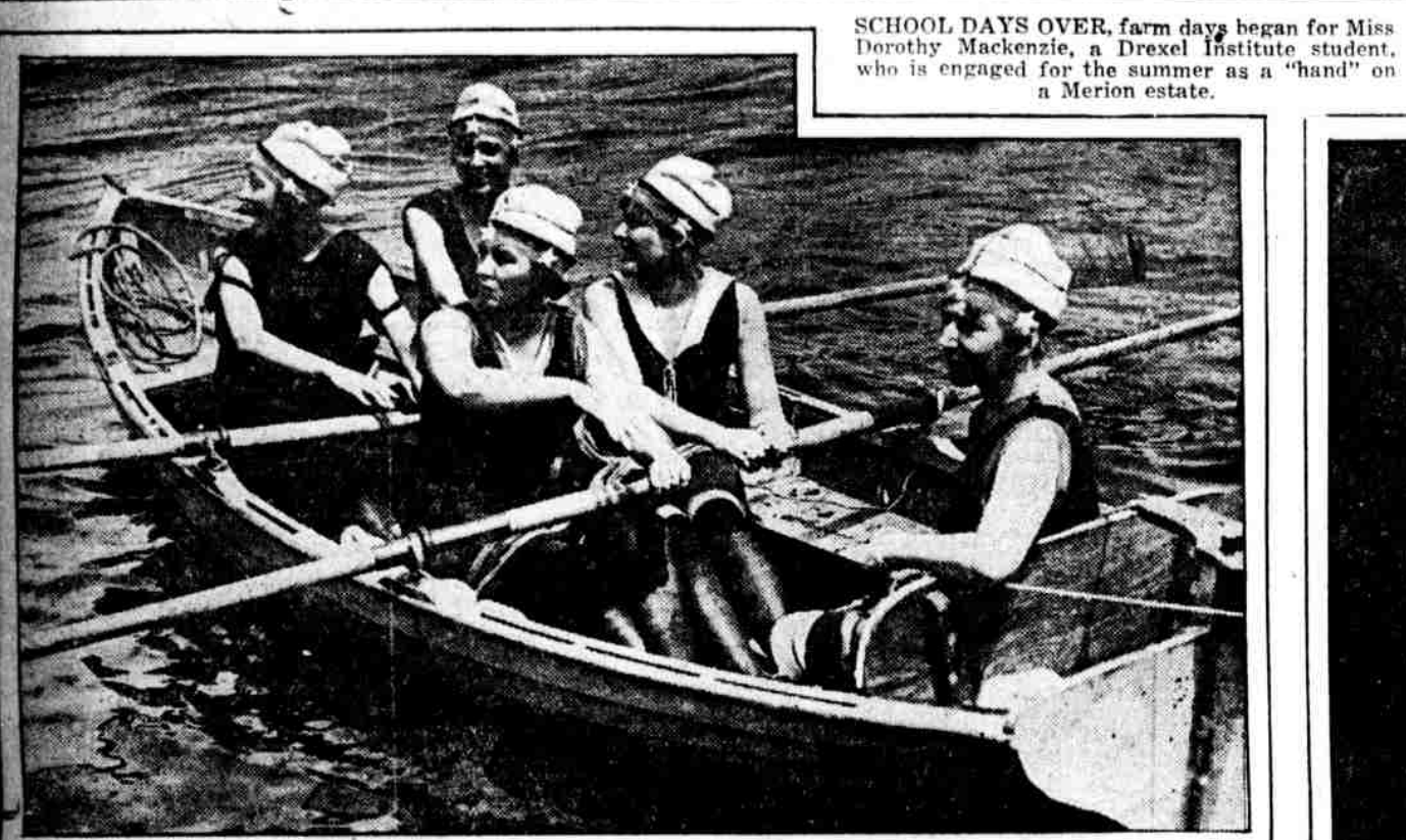
AMONG OTHER THINGS, the navy's yeowomen are good oarsmen, or should it be oarswomen? At least, such is the case with the quintet above, winners of the Fourth of July race on the Charles River at Boston.