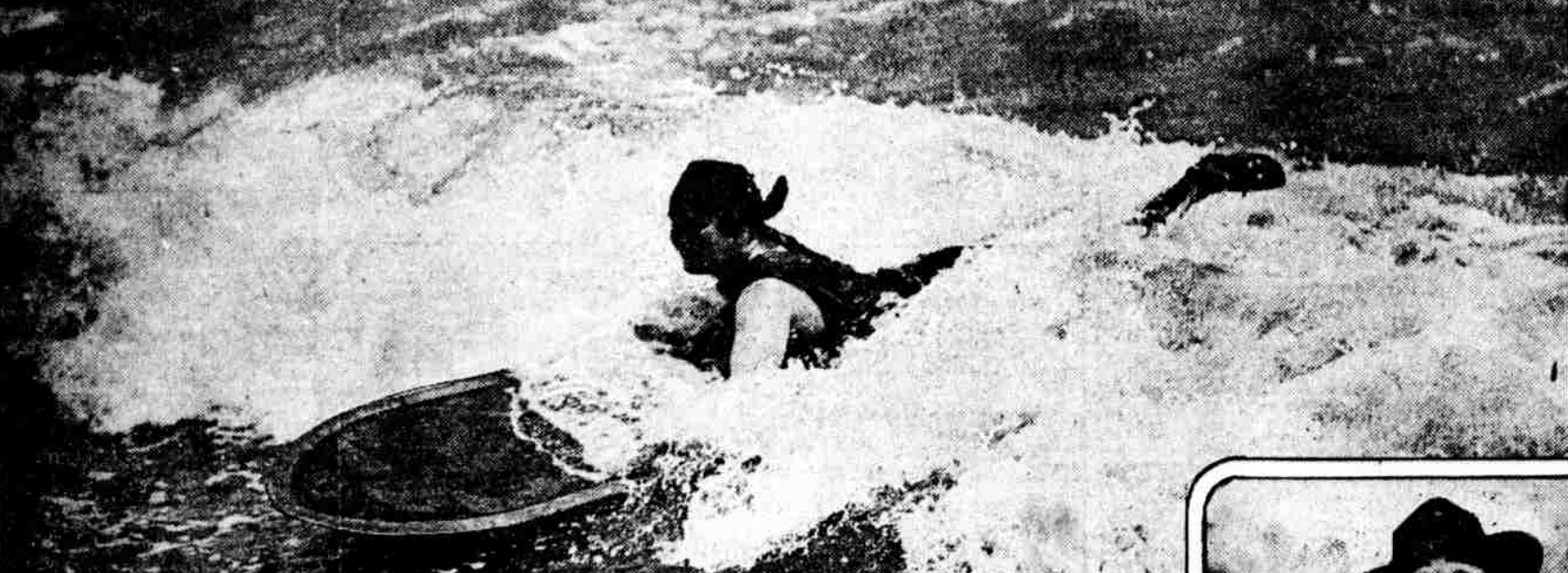
THE SURF BOARD is a never-ending source of delight for the fair bathers at Atlantic City and the other