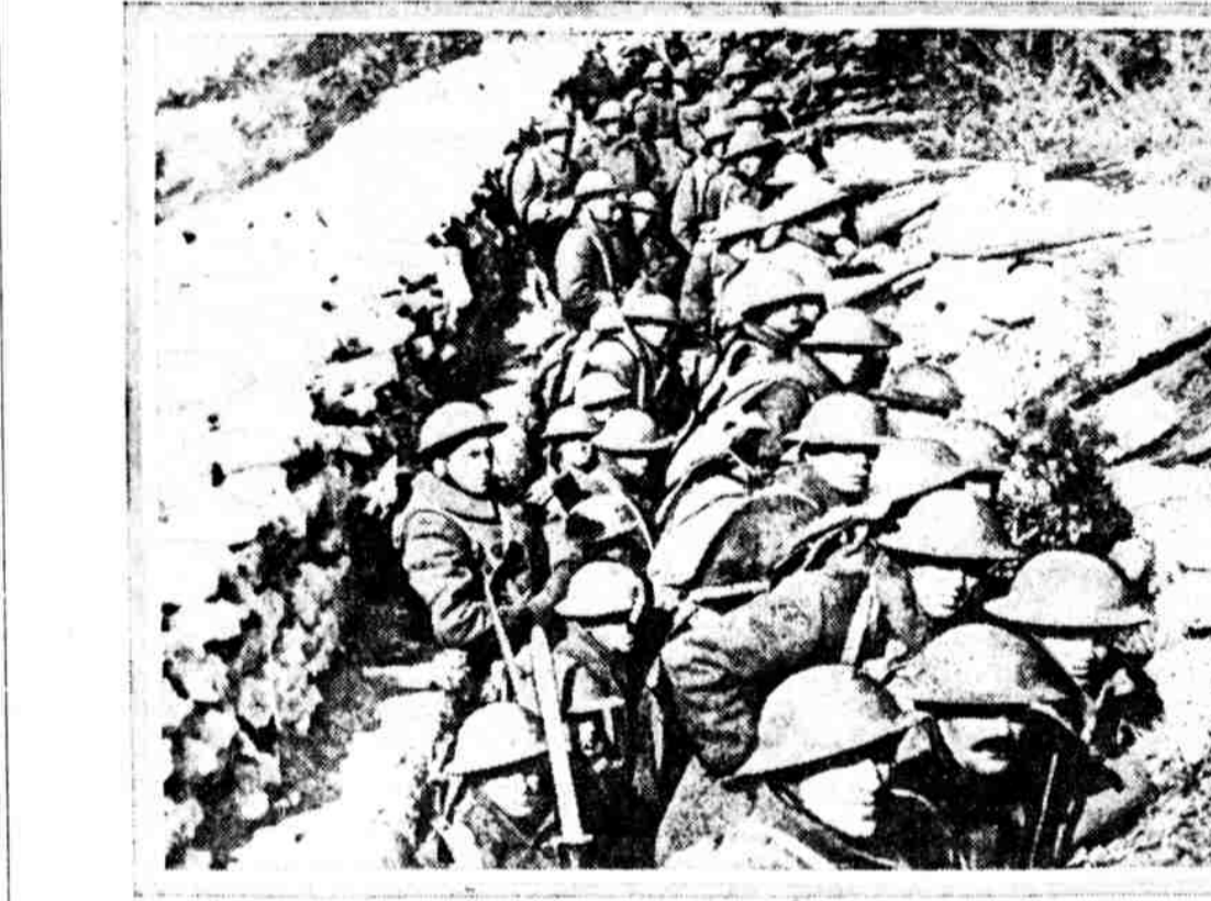
American infantry in trench.