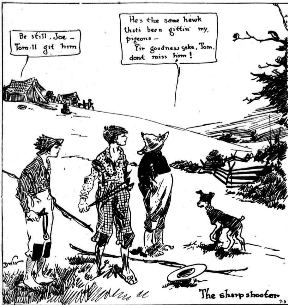
The sharp shooter