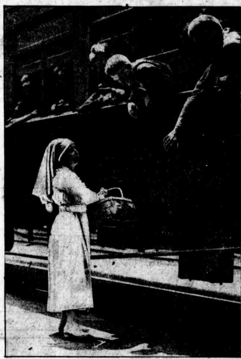
HERE IS A SCENE many times re-enacted in Philadelphia these days, in which women of the Red Cross Canteen Service hand out good things to eat to the lads "passing through" on their way "over there."