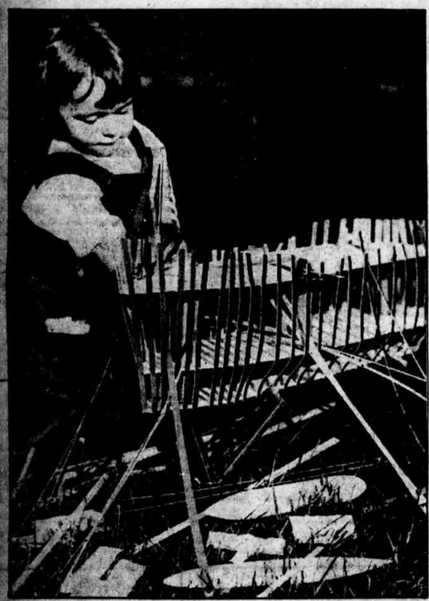
THE FERVOR FOR SHIPBUILDING has permeated the ranks of our infant population, so responsive to the leanings of us adults. A miniature ship is a toy well worth constructing, even if all the laws of ballast are not obeyed.