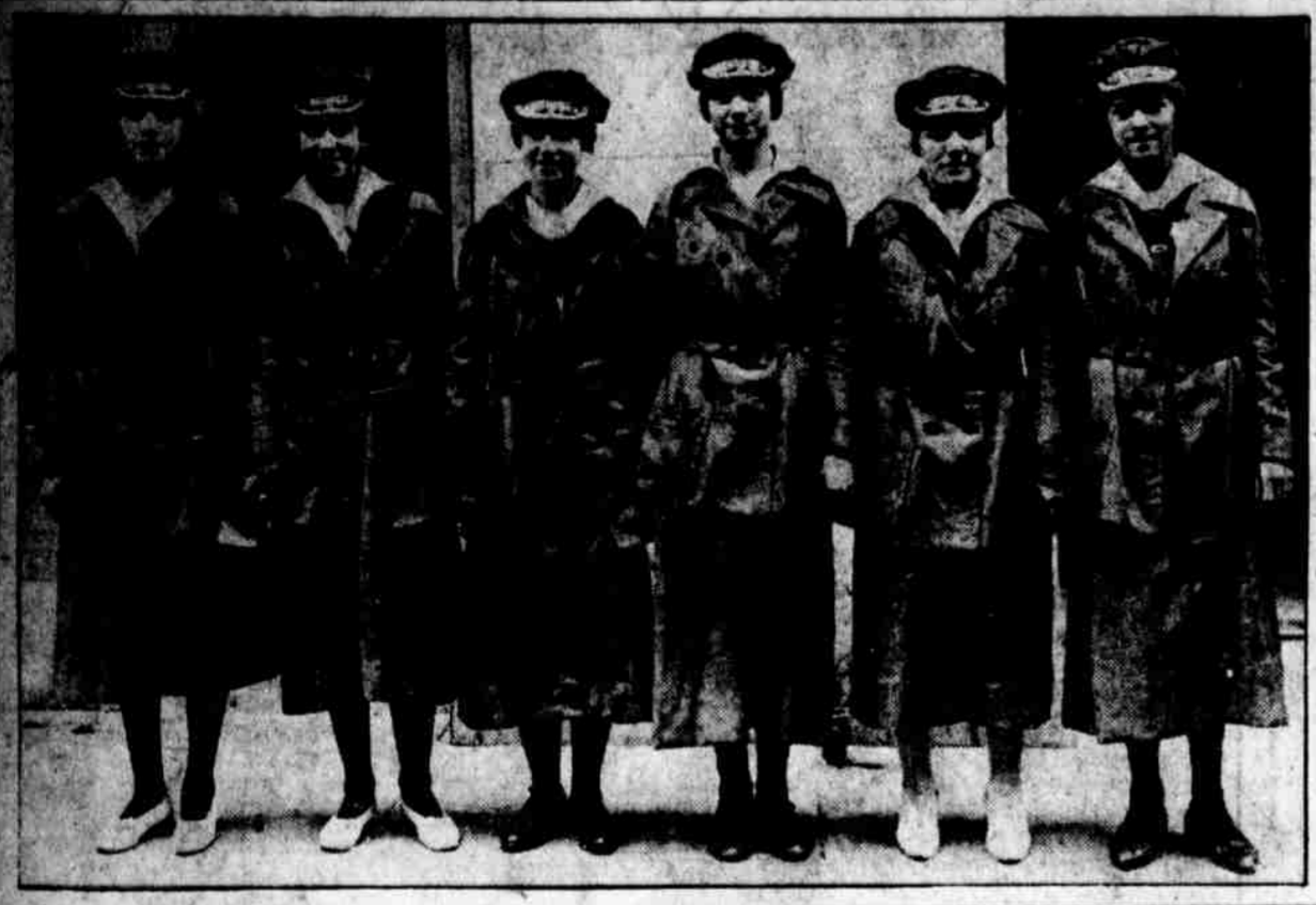
IT LOOKS AS THOUGH the days of novel-reading messenger boys are numbered, now that the courteous "messenger girl" in natty khaki uniform has made her appearance at the nation's capital. At least the boys will no longer have the field to themselves.