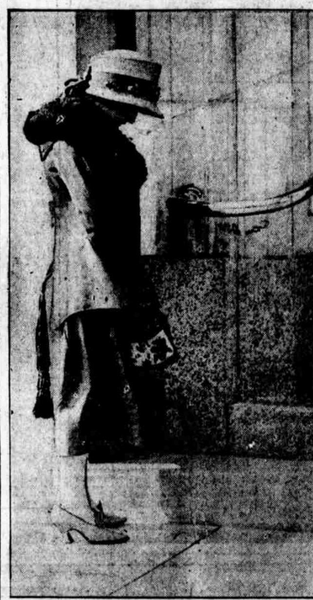
JUST AT NOON, when the chimes of Holy Trinity ring out, many Philadelphians, young and old, pause for the nonce and offer a prayer for the safety of the boys "over there."