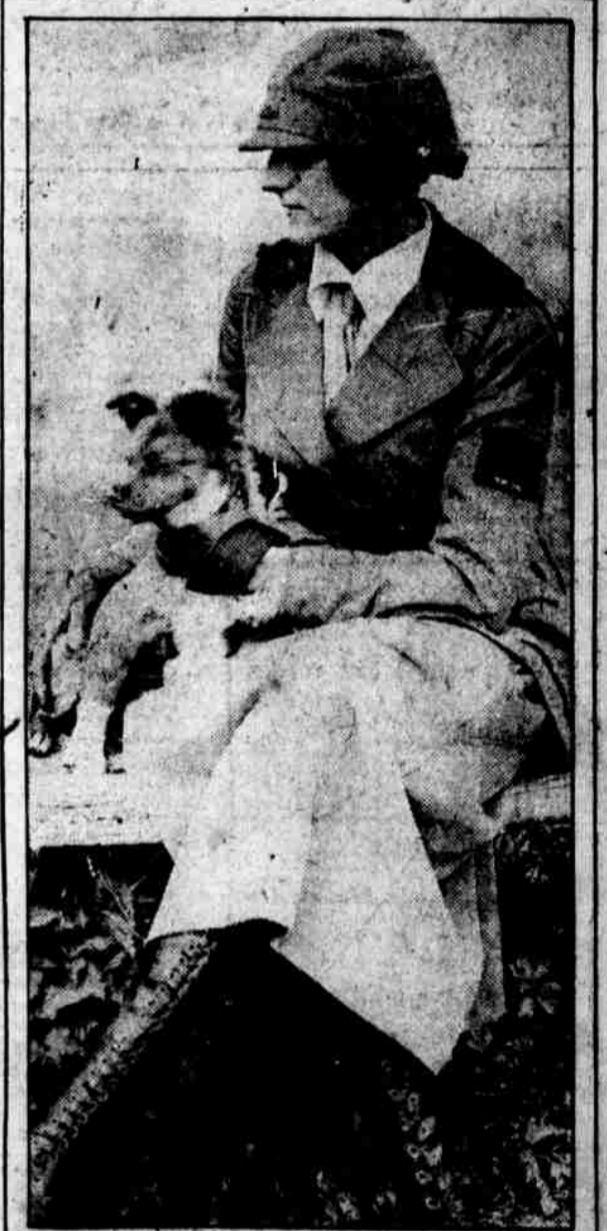
AMERICAN WOMEN have undertaken perilous tasks. Here is an American woman who is driving an ambulance along shell-torn roads in France.