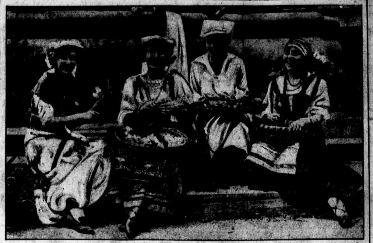
ITALY IS VERY MUCH in the news these days with her victory over the Austrians, not to mention the Italian Festival for the Relief Fund for Blind Soldiers being held on the esplanade of the Public Library in New York.