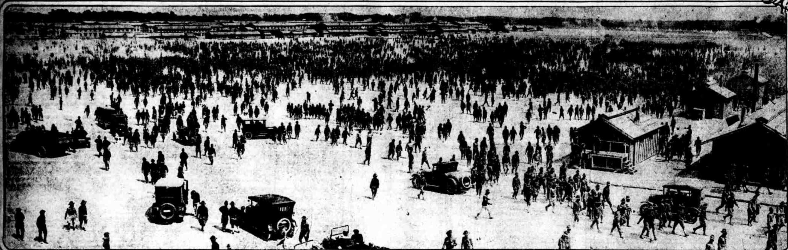
A HUMAN LIBERTY BELL was formed by 25,000 men on training field at Camp Dix. Above, the bell is in process of formation. Photograph to left shows men thronging to barracks after break-up alignment.