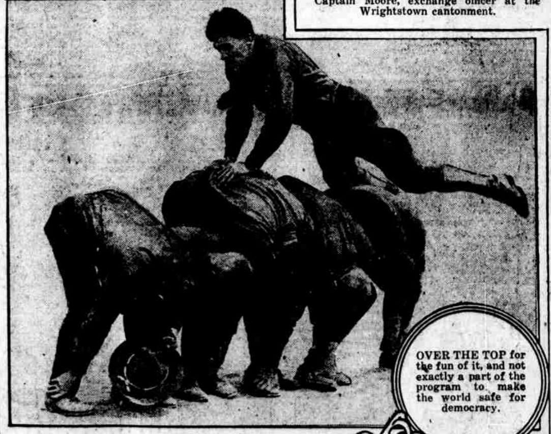
OVER THE TOP for the fun of it, and not exactly a part of the program to make the world safe for democracy.