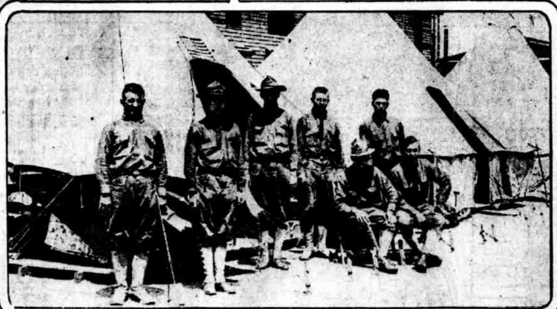
IT TAKES ALL KINDS of units to make up an army. For instance, above are the doctors, or "pillboys" as the soldiers know them, attached to the 153d depot brigade. Over to the left some of the lads who look after war-risk insurance at Camp Dix are taking a few risks themselves. Below, a contingent of draftees is learning how to salute.