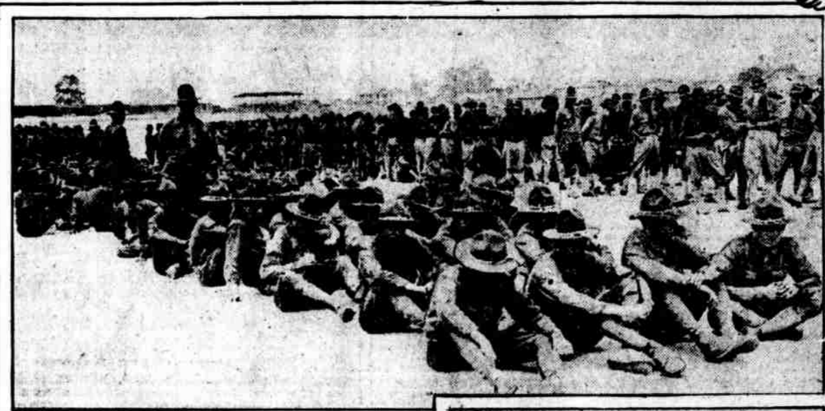
MOST WELCOME of all orders to the man in training is the "at ease" following a strenuous drill or hike.