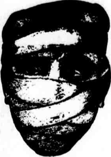
Eyes left.