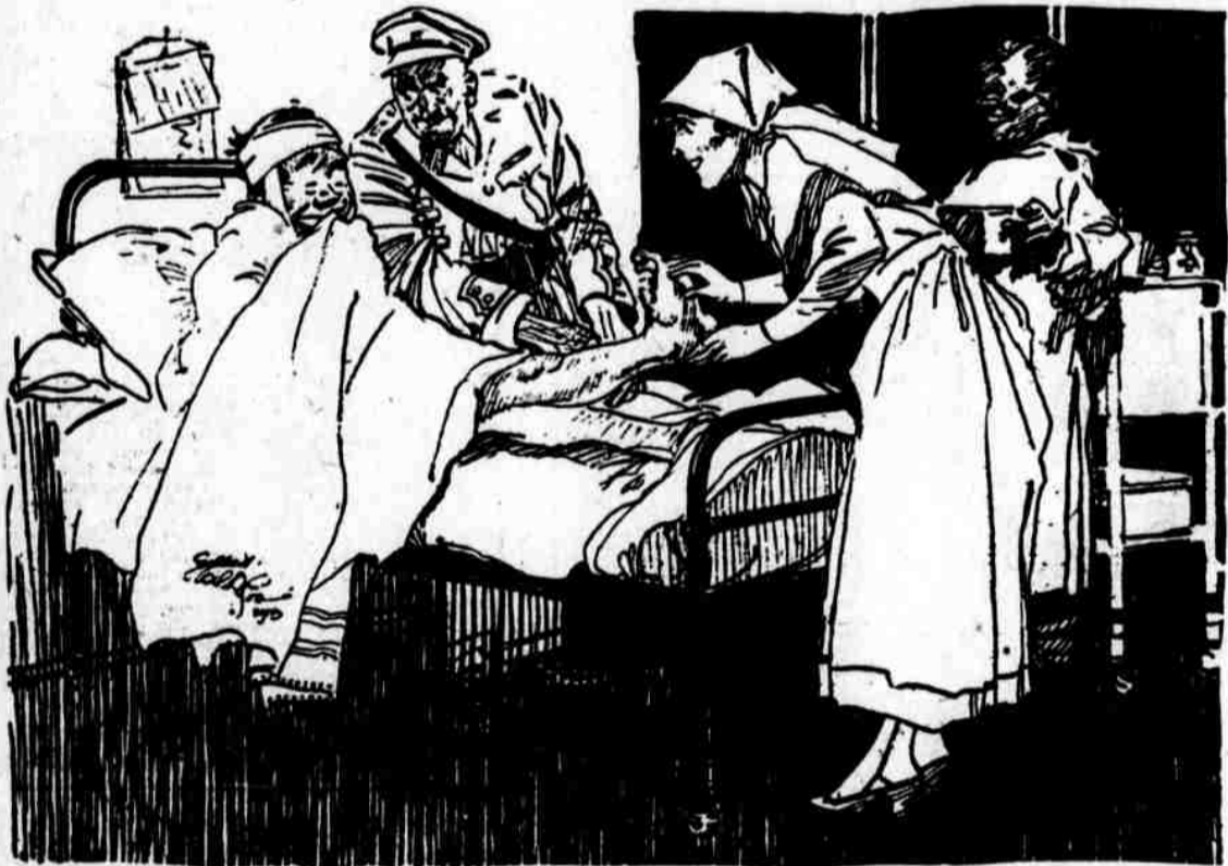
A little battered but not altogether unhappy.