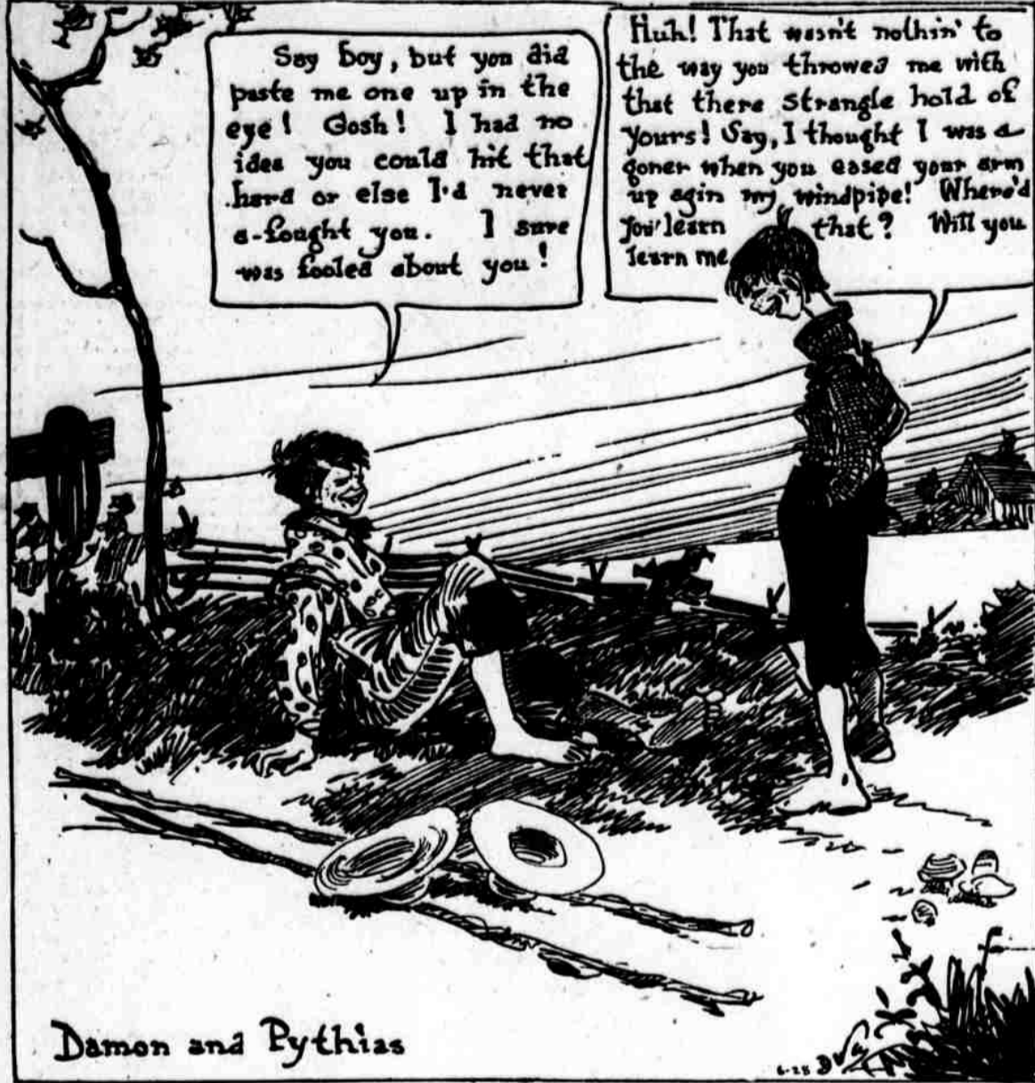
Damon and Pythias