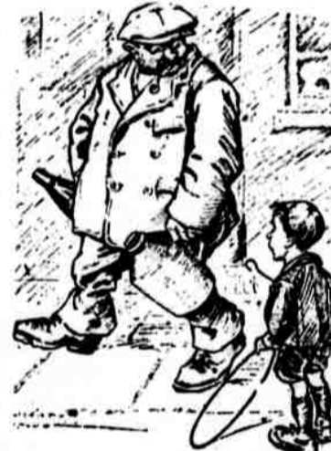
—The Passing Show. "Wot's the time, mister?" "Five parat cloin' time, son."