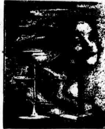
—Princeton Tiger. Drink to me only with thine eye.