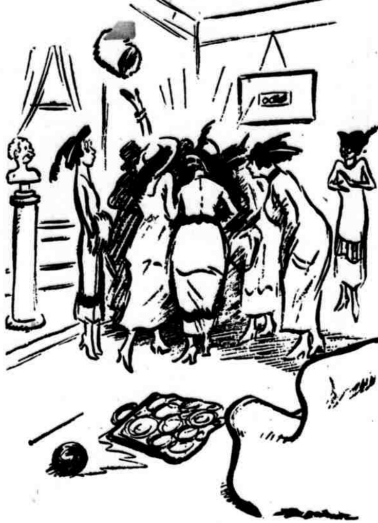
The good news about the Browning gun reaches the Browning Club.

Promotion Backward The rookie was being taken to the guardhouse. "Quick promotion," he muttered to himself. "I'm already in charge of a squad of men."—Boston Transcript.