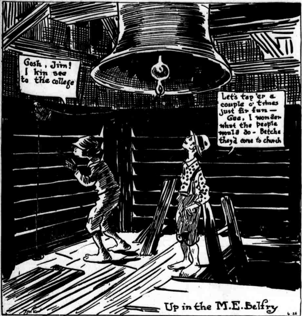
Up in the M.E. Belfry