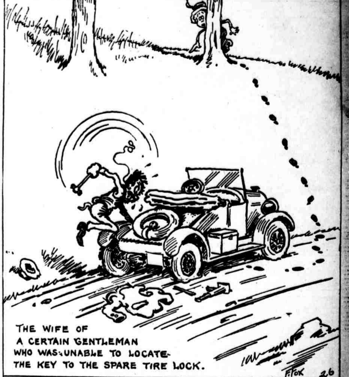
THE WIFE OF A CERTAIN GENTLEMAN WHO WAS UNABLE TO LOCATE THE KEY TO THE SPARE TIRE LOCK.