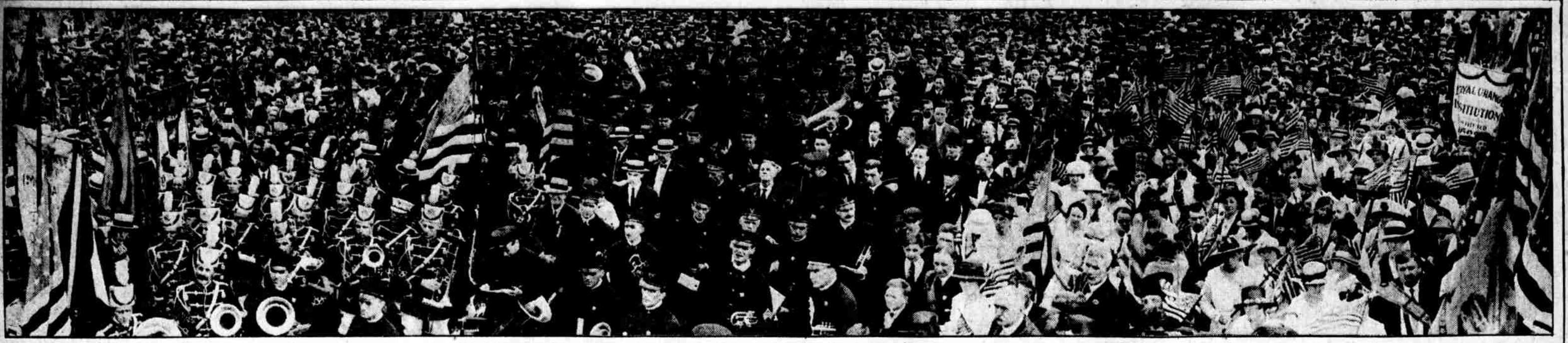
THOUSANDS OF VOICES raised in song on Belmont Plateau in Fairmount Park demonstrated how solidly the memberships of the various patriotic and fraternal organizations in Philadelphia are behind the national war program.