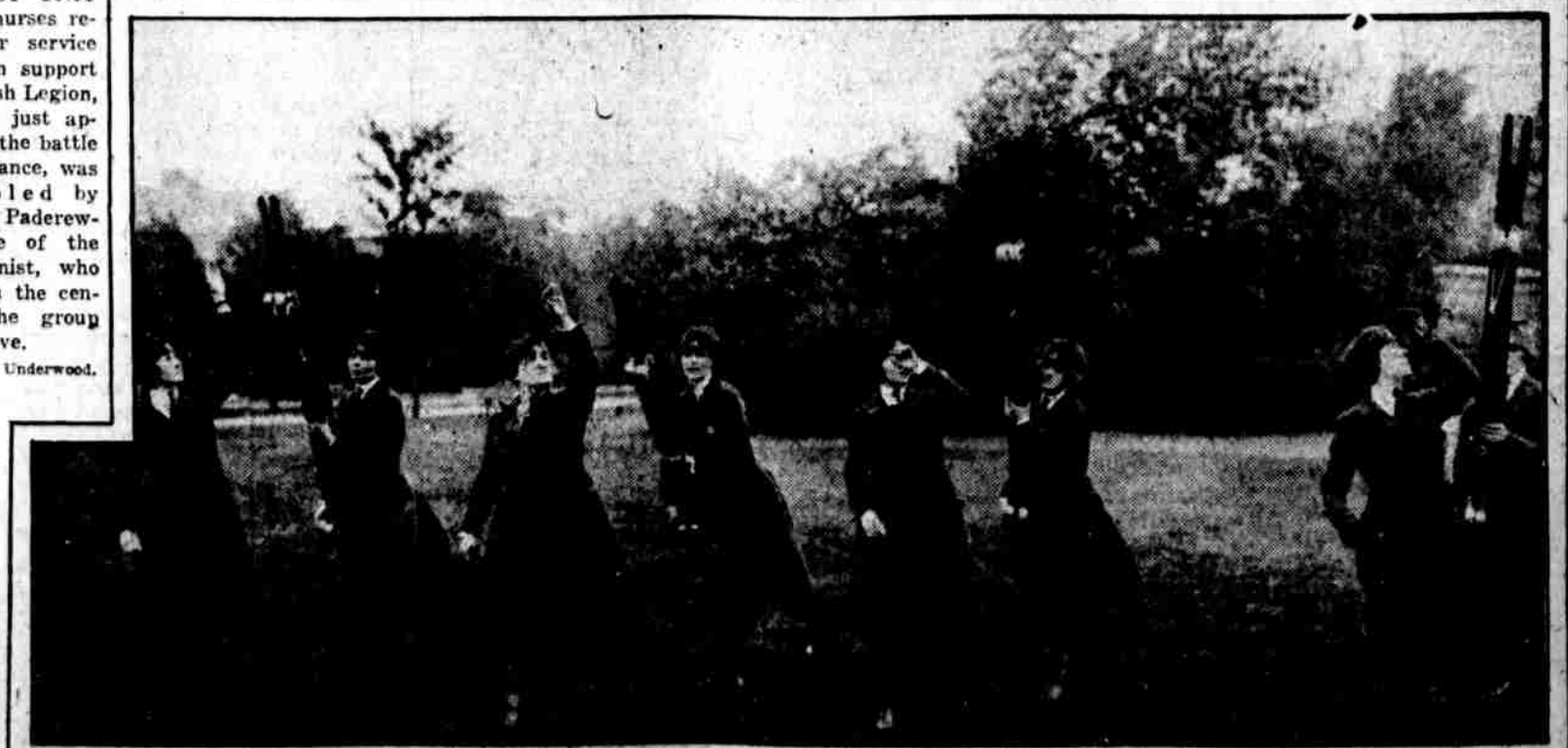
THE USEFULNESS OF THE WOMEN enrolled in the Jersey City Motor Service is not confined to scurrying about on patriotic errands, for they are prepared to act as stretcher bearers and furnish first-aid to the wounded should occasion arise.