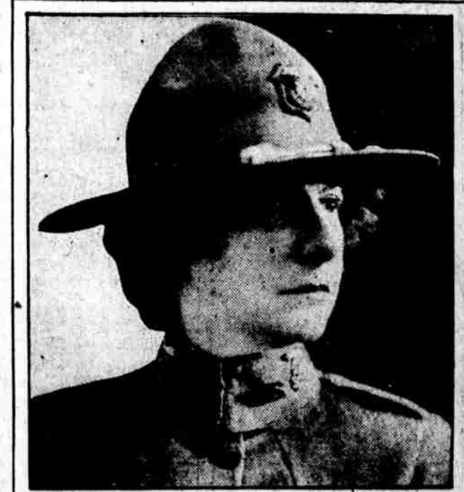
MUCH COURAGE has been displayed by Salvation Army women in France, of whom Commander Evangelino Booth, shown in uniform she wears overseas, is leader.