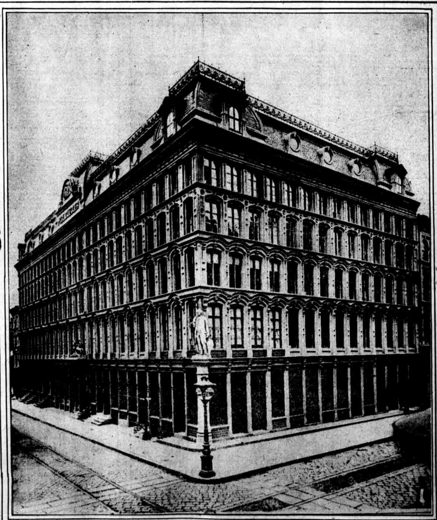
JUST FIFTY-ONE YEARS AGO to this very day the greatest newspaper office in the United States was opened with appropriate ceremonies in the present home of the Ledgers, at Sixth and Chestnut streets. It was on June 20, 1867, that the Public Ledger began publication in the brownstone building here shown as it then appeared.