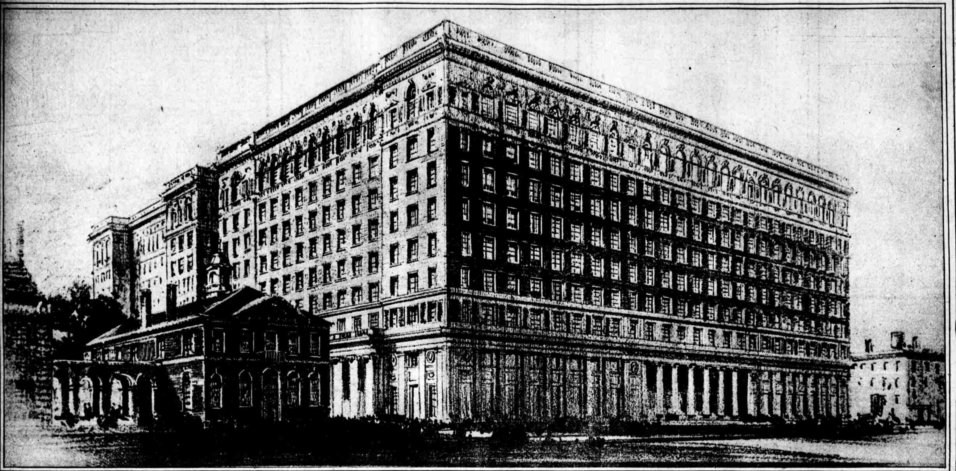
SPACIOUSNESS WILL BE the distinguishing feature of the new Ledger Building, here shown in a reproduction from a perspective drawing of the architects' exterior plans. Ten stories in height, the structure will occupy the entire block bounded by Sixth and Seventh, Chestnut and Sansom streets. The architecture is a happy adaptation of the Colonial, quite in keeping with the location beside Independence Hall. The building will be of red brick, with marble base and coping similar in style to the Curtis Building.

NEW LEDGER BUILDING WILL AGAIN SET THE PACE FOR AMERICAN NEWSPAPER ENTERPRISE