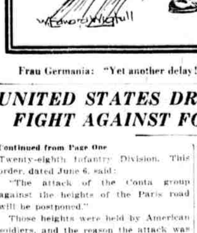
Frau Germania: "Yet another delay! Are we never going to get there?"