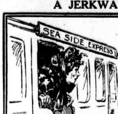
Frau Germania: "Yet another delay! Are we never going to get there?"