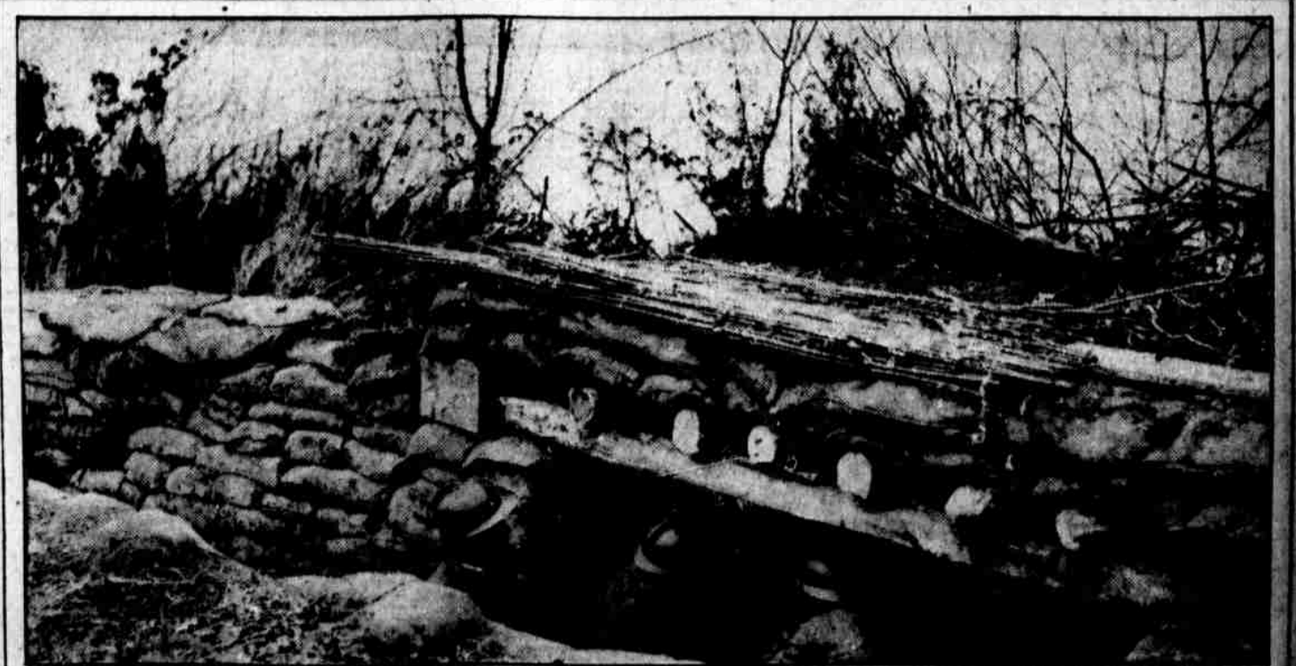
ANOTHER VIEW OF THE PIAVE, looking across the river toward the north bank, held by the Austrians, from an Italian dugout on the south bank, held by the Italians.