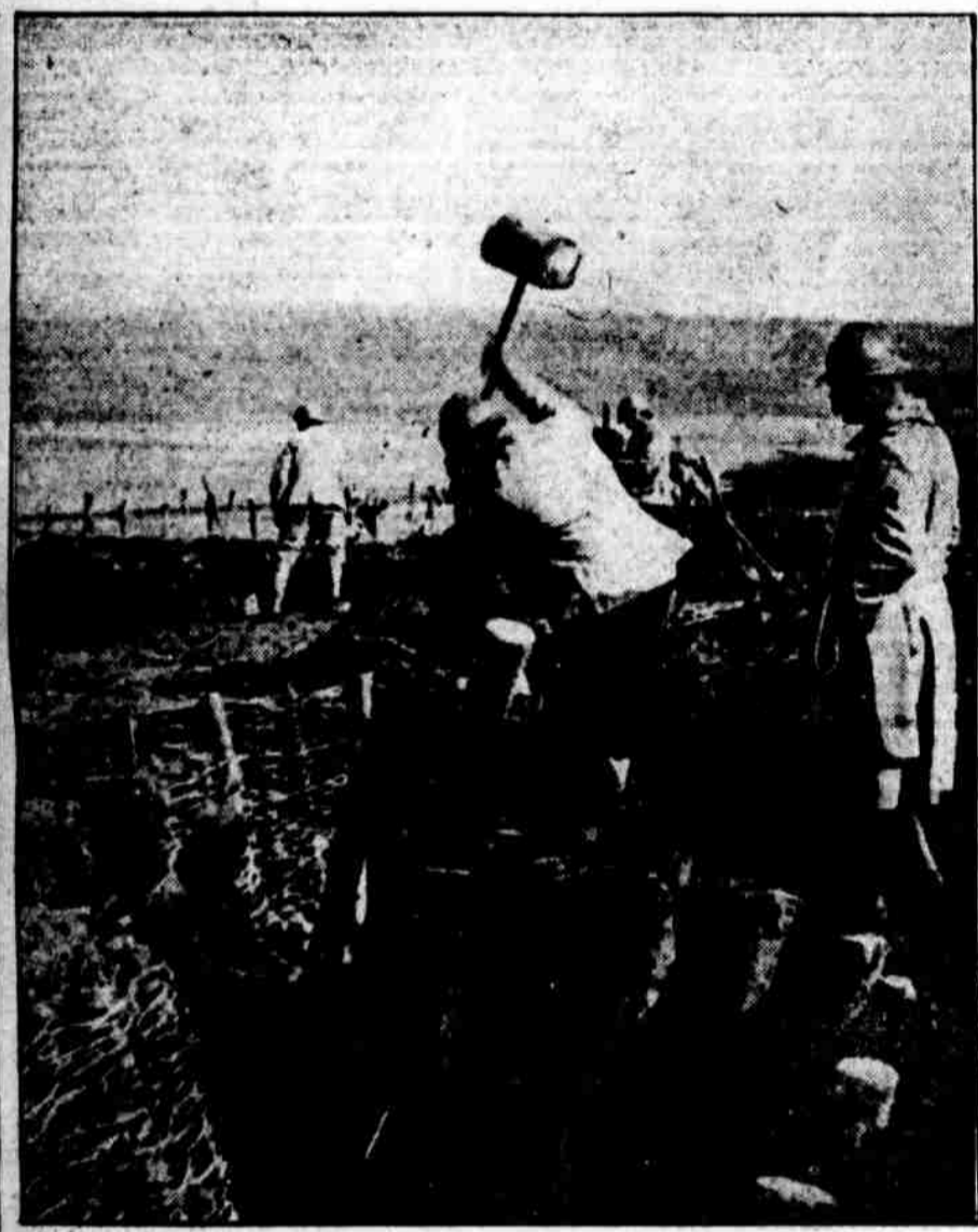
TO THEIR GREAT SORROW, the Austrians ran afoul of the sturdy trench system constructed by the soldiers of General Diaz during the long winter months.