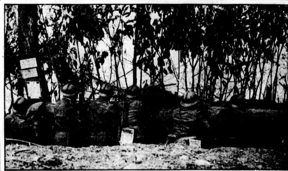
DIRECTLY OVERLOOKING the Piave, these Italian soldiers are among the troops of General Diaz who took such a heavy toll from the Austrians when they endeavored to cross.