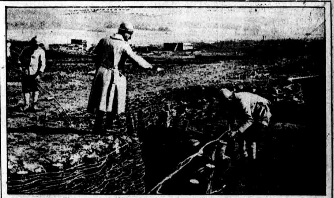
DURING THE LULL following the stoppage of last fall's advance of the Austro-Germans every effort was made to strengthen the defenses of the Piave, as shown above.