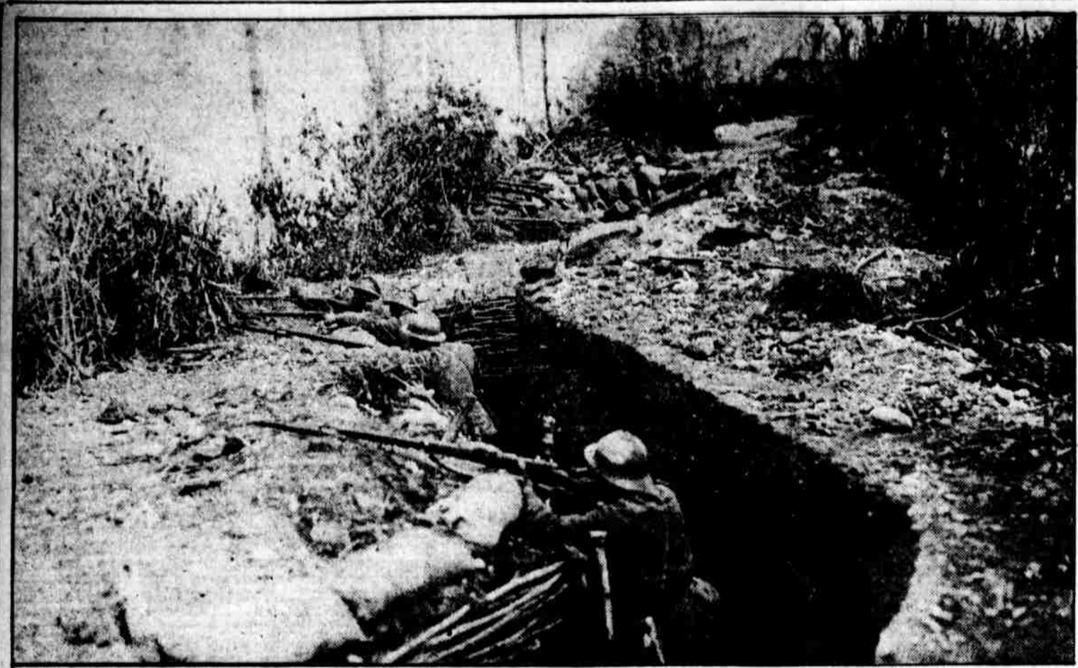
HERE YOU HAVE the famous Piave River, with its brave defenders in their trenches, awaiting an Austrian effort to cross the barrier.