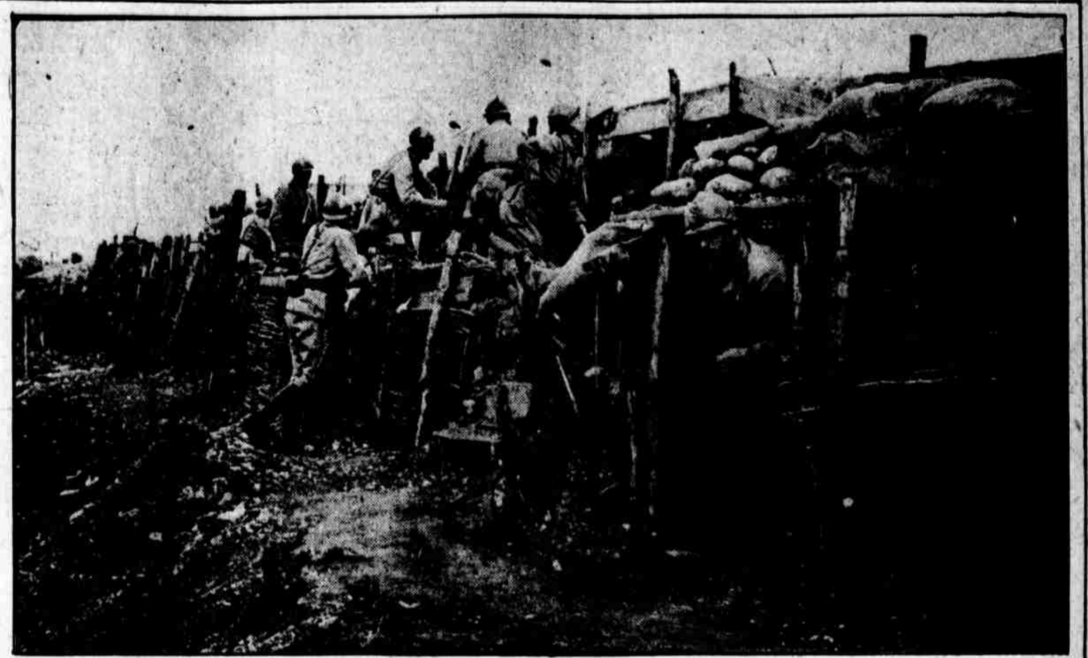
THE LOWER PIAVE does not lend itself readily to fortifications, but the Italians strengthened as best they could the trenches along the south bank of the river.