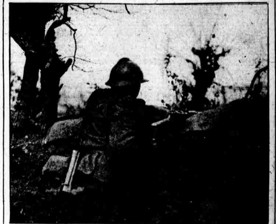
DAY IN AND DAY OUT the vigilant Italians awaited the coming of the Austrians from their vantage point on the south bank of the friendly Piave.