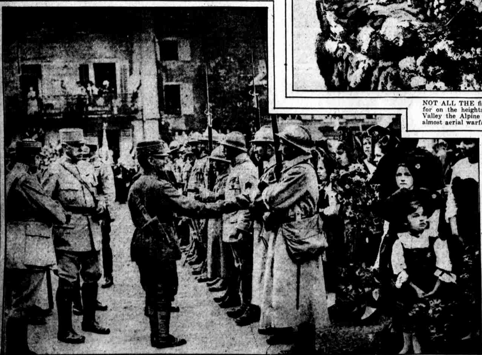
SIDE BY SIDE WITH THE BRAVE ITALIANS, troops from France are helping hold the line. The photograph shows King Emmanuel congratulating French soldiers who distinguished themselves by bravery in action.