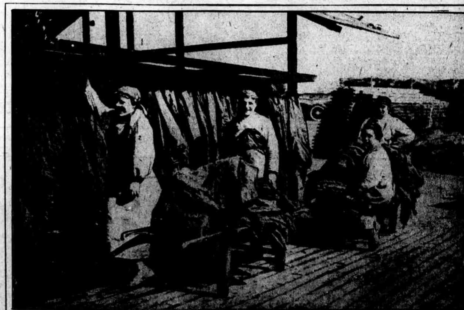
AS CLEVER AS THEY ARE PRETTY, these French girls are aiding in camouflage work to puzzle and defeat the Germans in their offensive.