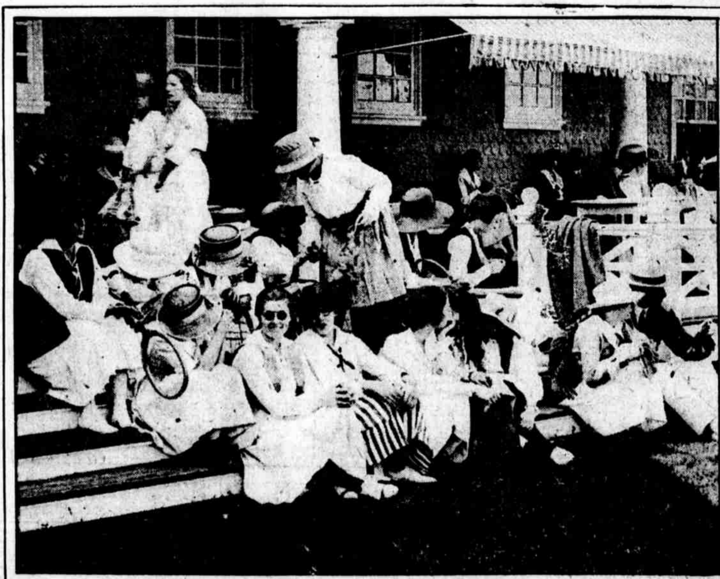
AMERICA'S ATHLETIC YOUNG WOMANHOOD was assembled in imposing and charming array at the clubhouse of the Philadelphia Cricket Club at St. Martins before the preliminary games drew all to the courts.