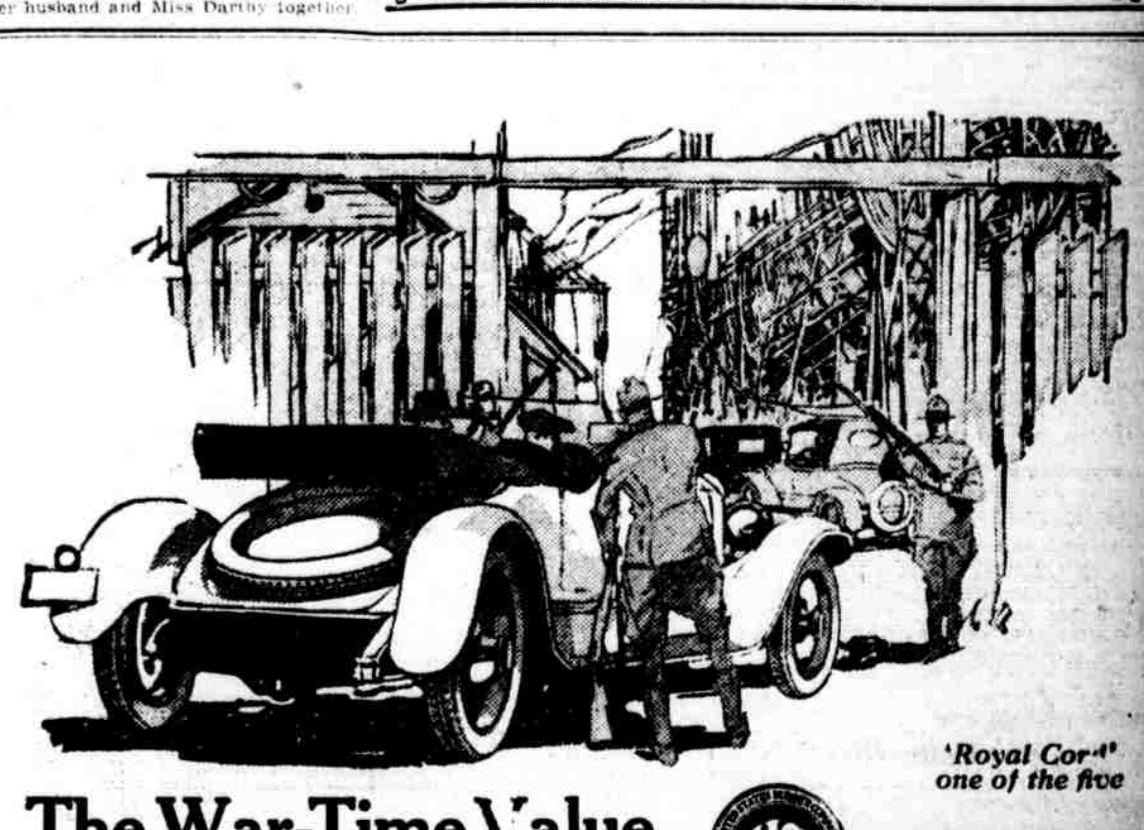
'Royal Cor' one of the best