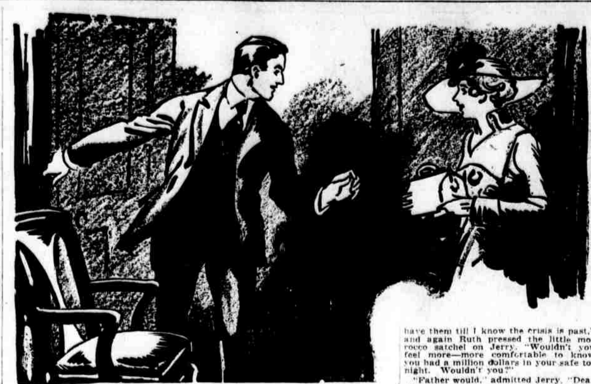
"Here," Ruth said, as she pressed a small morocco satchel, "there are one million dollars in Liberty Bonds."