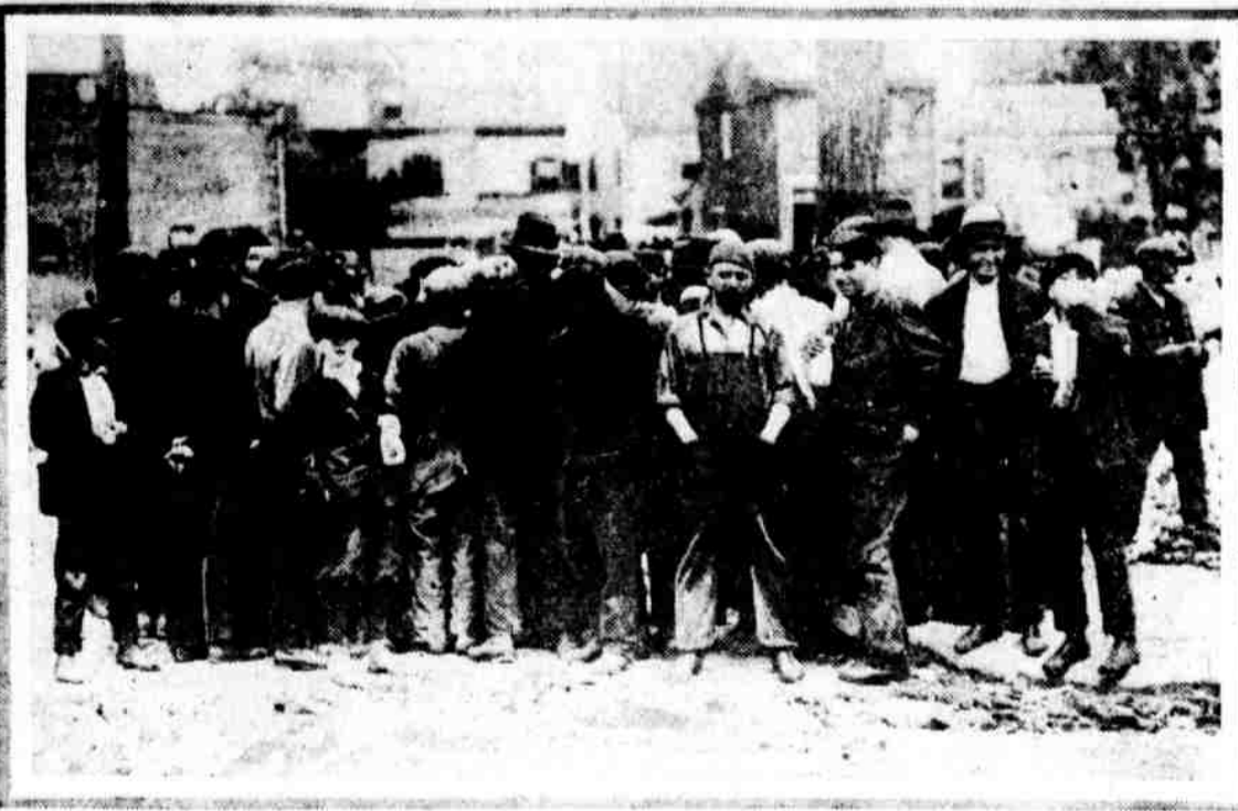
The men who are building our ships find milk an excellent substitute for beer and every day at noon they swarm around the milk wagons just outside the plant

USE IN PLACE OF AMMONIA WE (SEEK) COMMUNITY STORES (YOU) SAVE