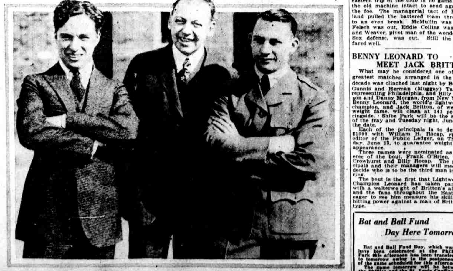
shows Charlie Chaplin, Billy Gibson and Benny Leonard.