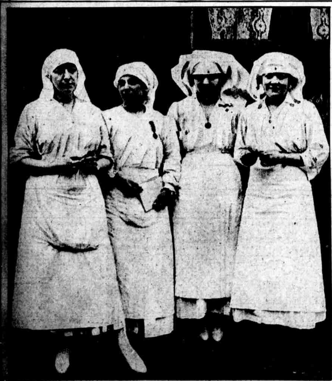
NO WAR IN WHICH AMERICA is participating would be complete without merciful nurses. "over here" caring for the wounded. Therefore, these American women in hospitals behind the battleline.