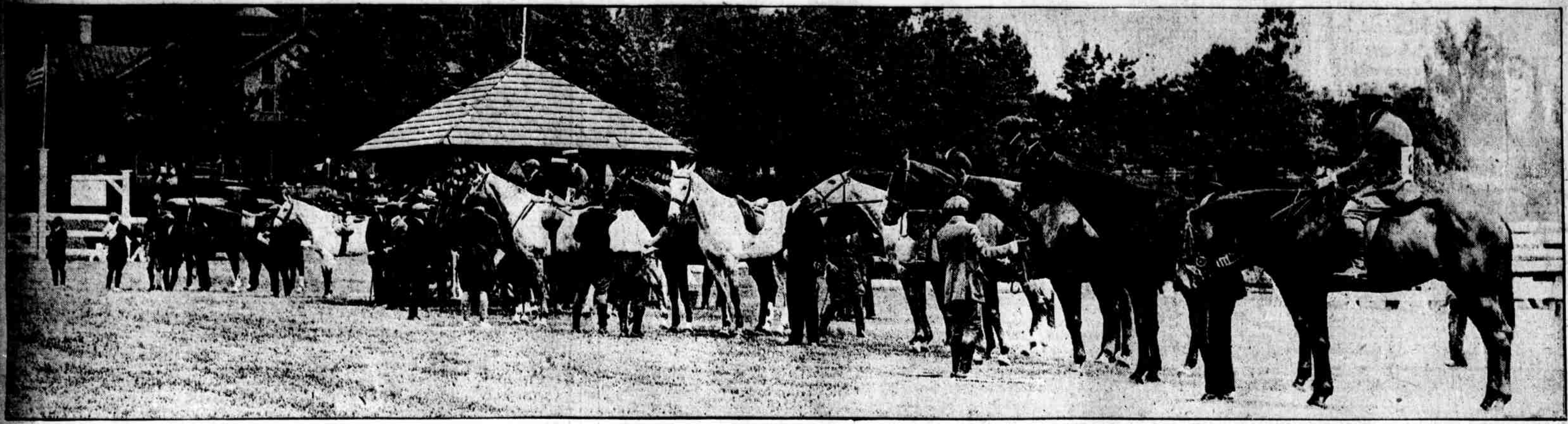
EVERYBODY LOVES a horse show, as this considerable line-up at Devon would attest.

NOW IT'S THE DEVON HORSE SHOW DOING ITS BIT FOR WAR RELIEF—A PAGE OF LIVE NEWS PICTURES