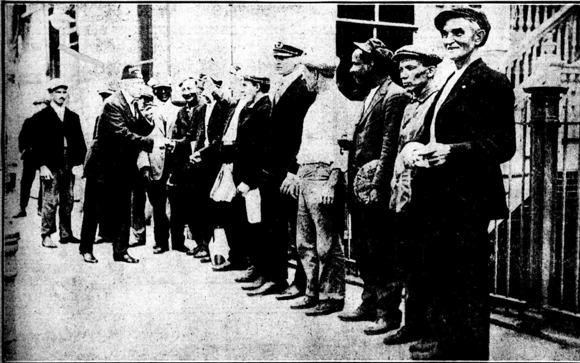
SHRINERS FROM LU LU TEMPLE, Philadelphia, did their bit in making the survivors from the S. S. Carolina as comfortable as possible at the shore. In the photograph above one of the Shriners is shown shaking hands with some of the survivors.