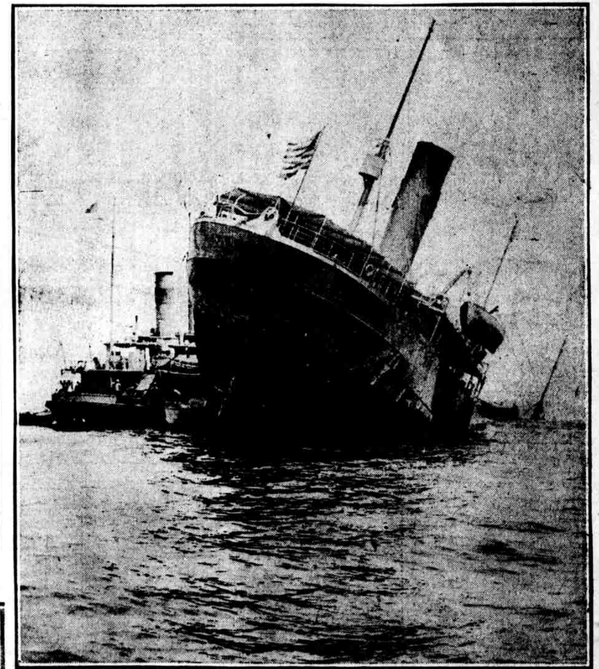
NO SOONER WAS THE NEWS that the tanker Pratt had been sunk in the shallow water off Lewes than plans were laid to raise her. The photograph above shows a wrecking tug at work on the tanker.