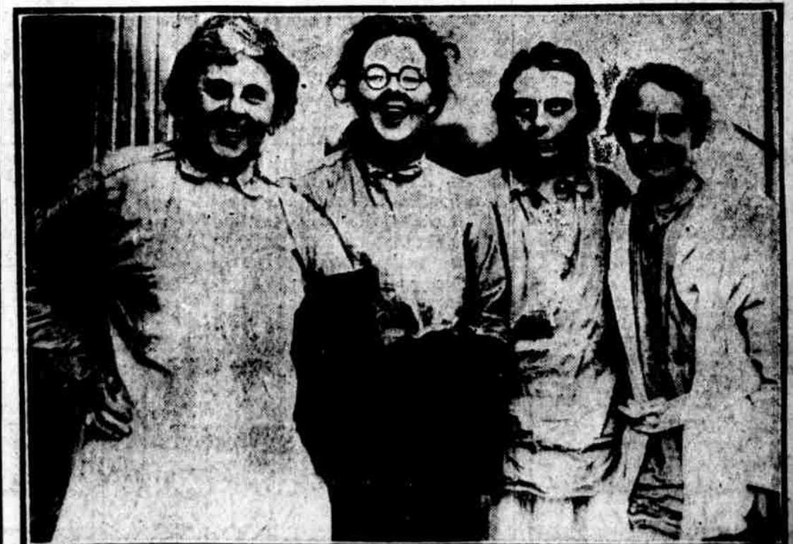
SAFE AND SOUND at Atlantic City, the women survivors of the steamship Carolina were minded to regard their terrible experience much in the light of a lark.