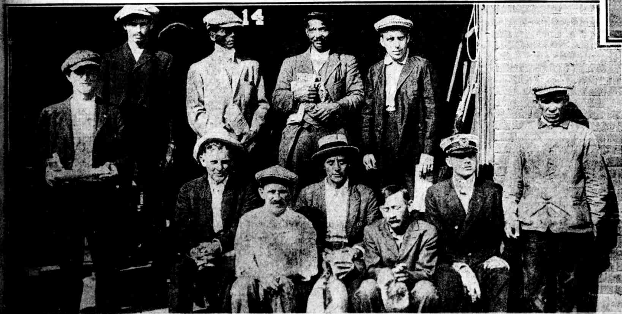
ONCE ON TERRA FIRMA again and properly fed and clothed, these members of the crew of the S. S. Carolina, landed at Atlantic City, called for the newspapers, with which they are plentifully supplied in the above photograph.