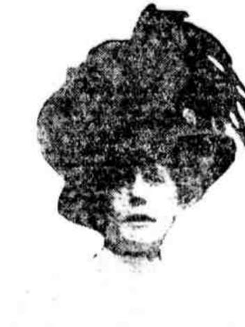
FIGURES IN STRANGE CASE. Maude Allan, the dancer, above, and Mrs. George Keppel, internationally known figures, in the trial...