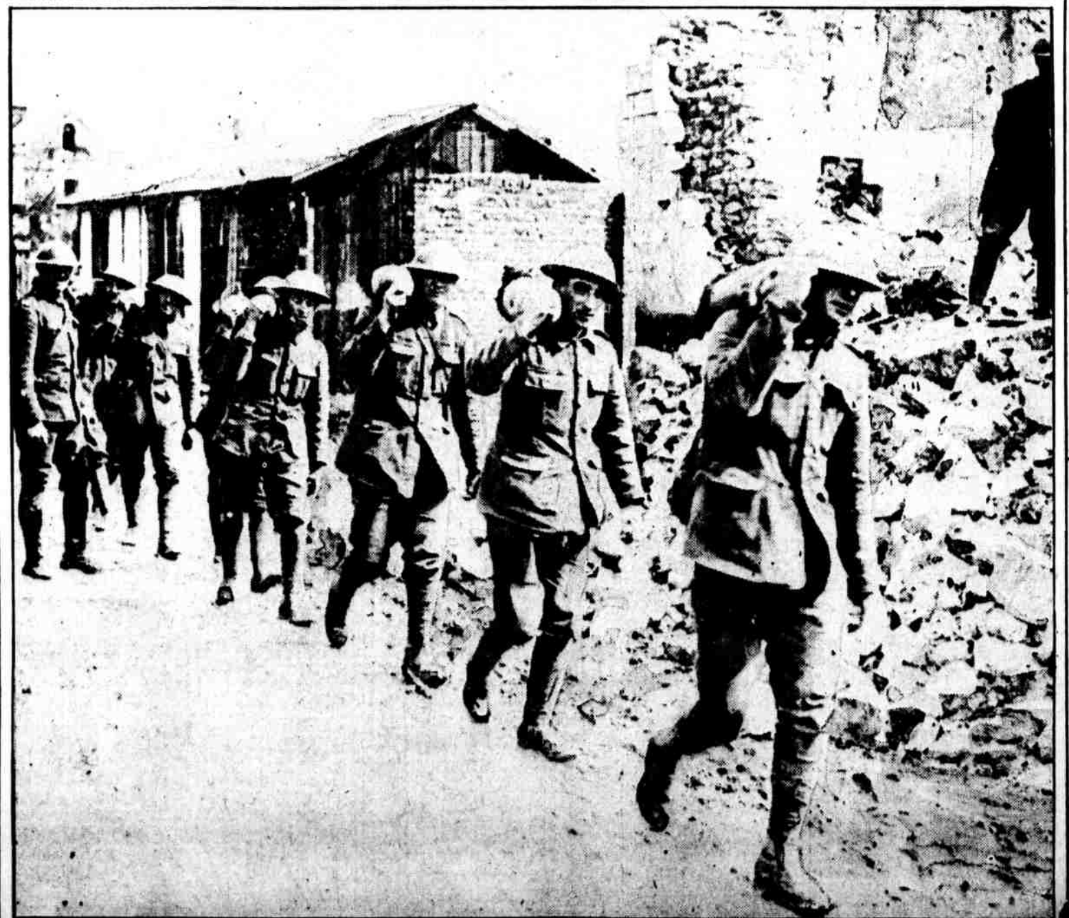
FOOD FOR THE GUNS is just as vitally necessary during an offensive as food for the men who are doing the fighting.