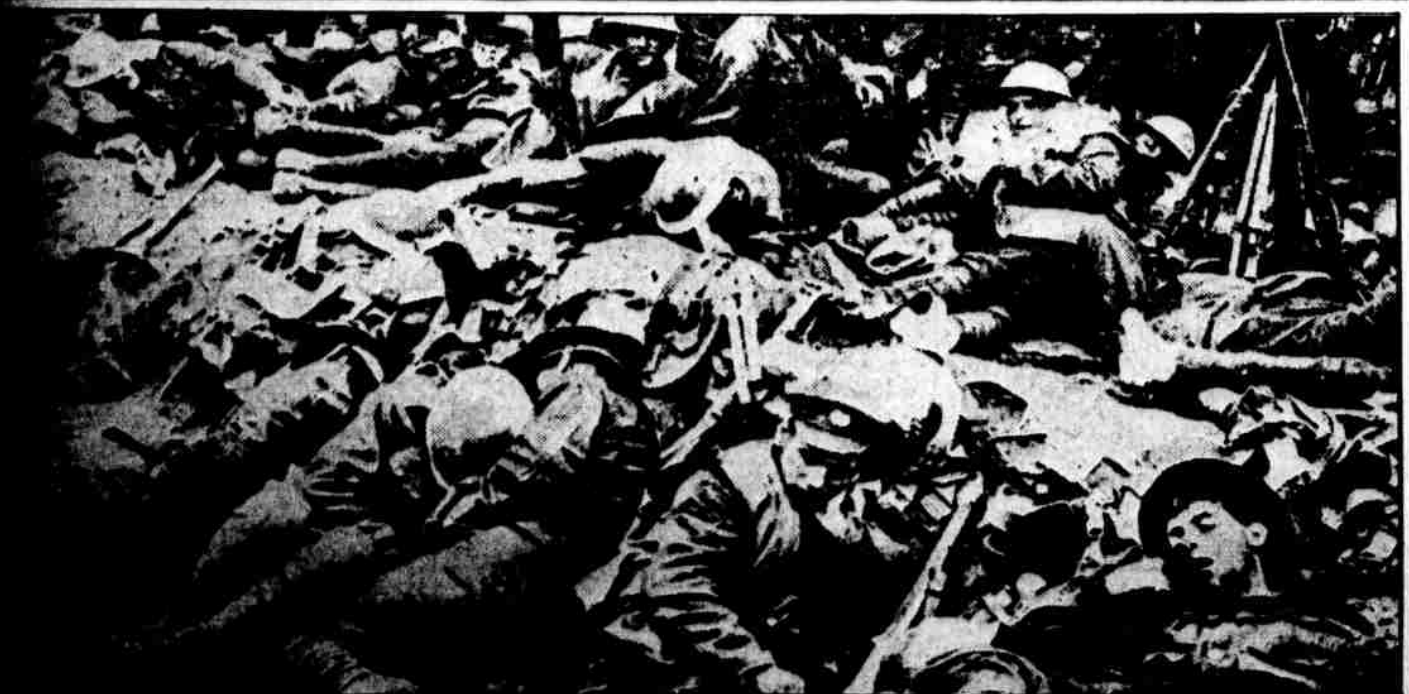
These British Tommies were so battle-weary when relieved of their