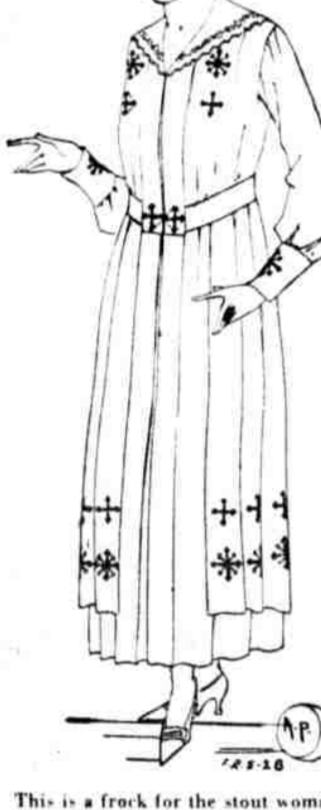
This is a frock for the stout woman.

WE hear a great deal of agitation these days in the fashion world over the stout woman. The consensus of opinion is that she is being woefully neglected by the makers of the models, and that it is high time she was receiving the consideration due her.