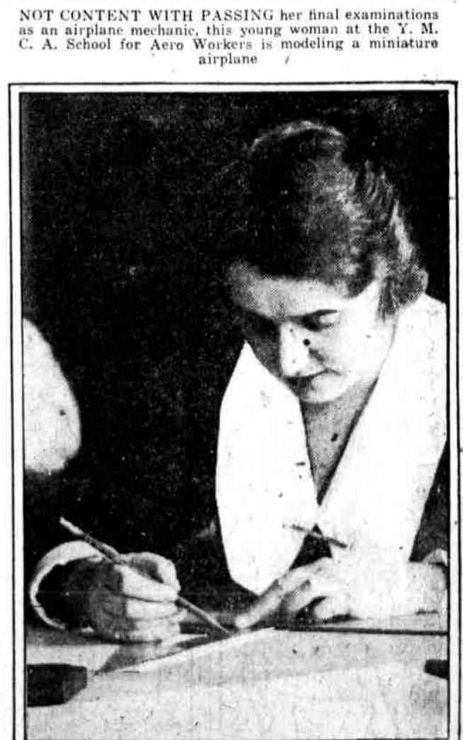
NOW IT IS DRAFTING which engages the interest of young women, with lessons to be had at the Y. M. C. A. school.