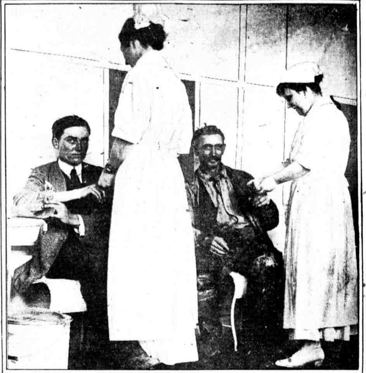
MANY AN INJURED SHIPWORKER has reason to feel thankful for the merciful presence of the nurses at Hog Island and their expert knowledge of the most approved first-aid methods.