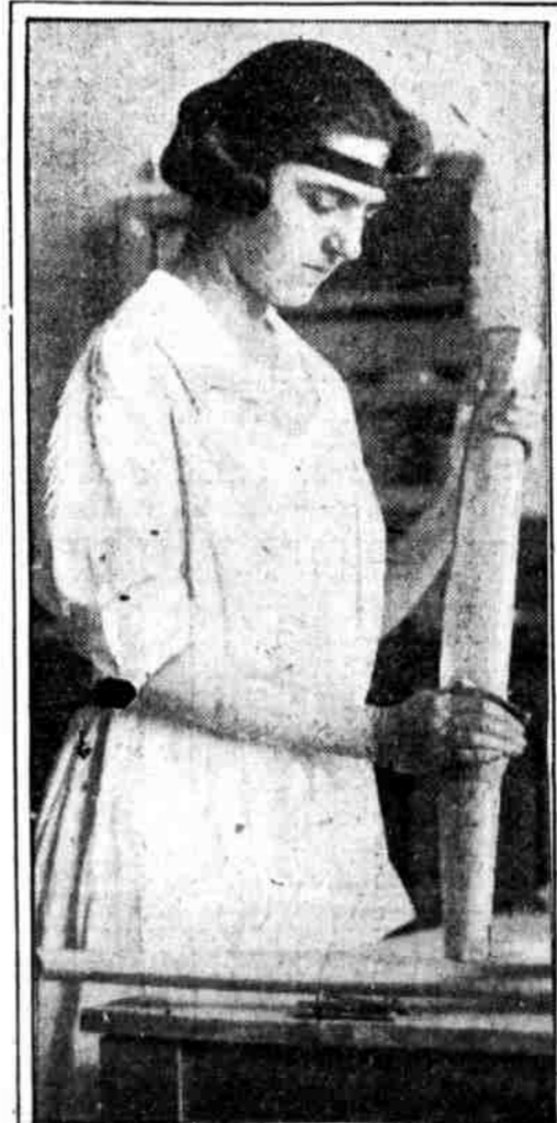
AN IMPORTANT AIRPLANE SECTION interests this student mechanic at the Y. M. C. A. Airplane School.