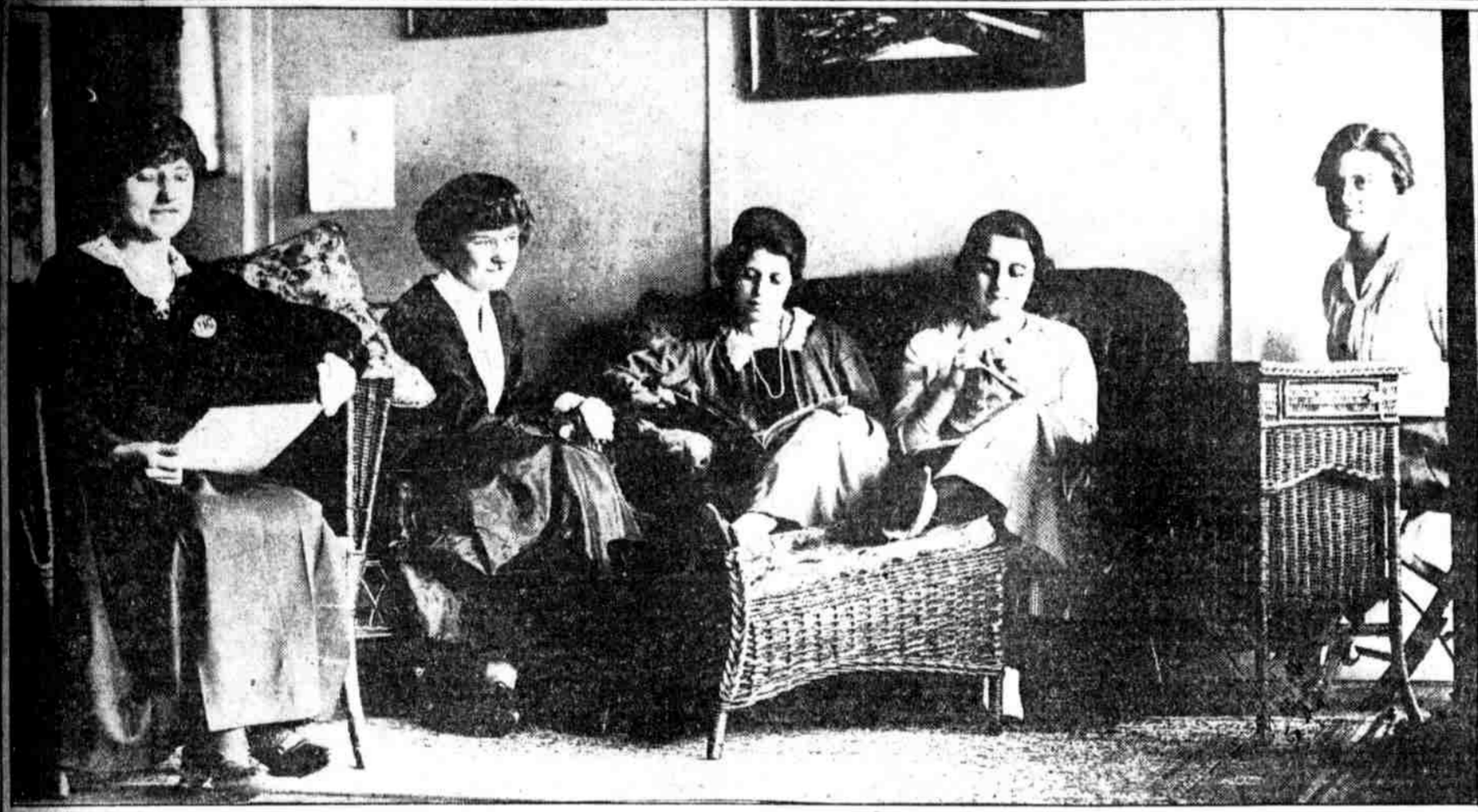
THE WELFARE OF THE SIX HUNDRED young women who by their valuable services in many important capacities are making it possible for 27,000 men to build ships at Hog Island is carefully watched over, as this photograph taken in the restroom will attest.