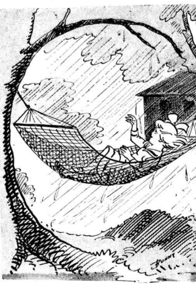
She landed in her own hammock at home.

"Farmer Dalton asked the Giant of the Woods, 'When do the boys want to enlist?'"