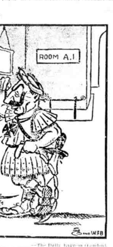
MAY—I GIVE MYSELF A PRIVATE VIEW OF MYSELF AT THE ROYAL ACADEMY.