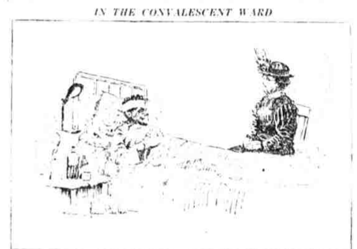
IN THE CONVALESCENT WARD