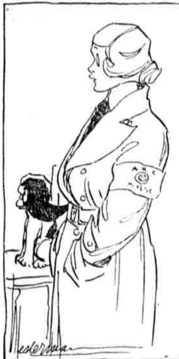
The young lady across the way says modern plays run too strongly to sex problems and if she had her way about it she'd bar every seat from the stage.

THE GUMPS—That's a Fine Thing to Teach Chester