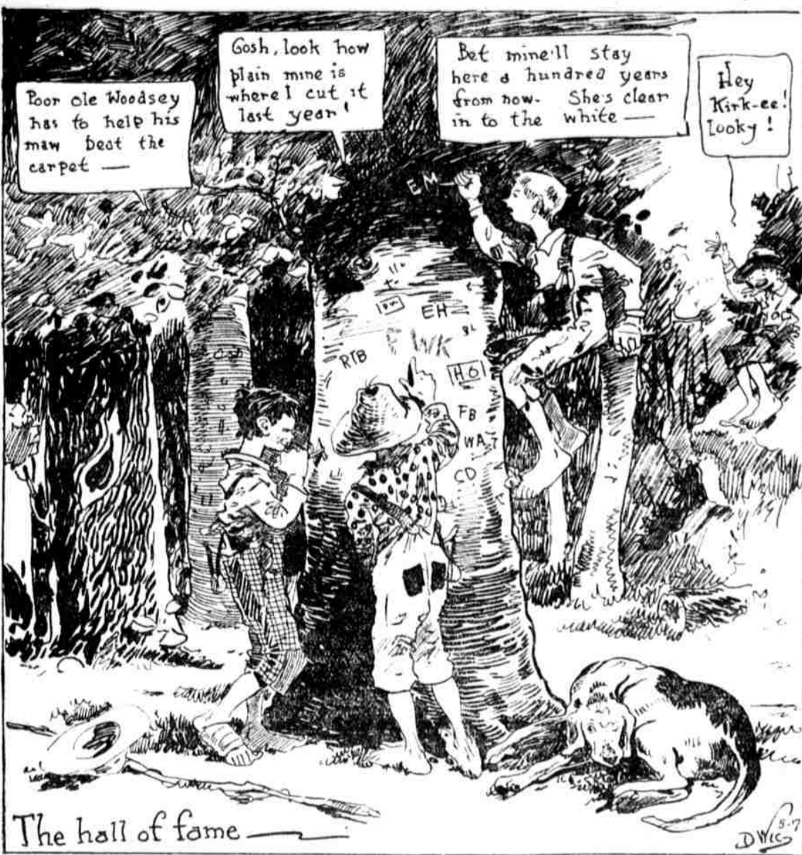
The hall of fame