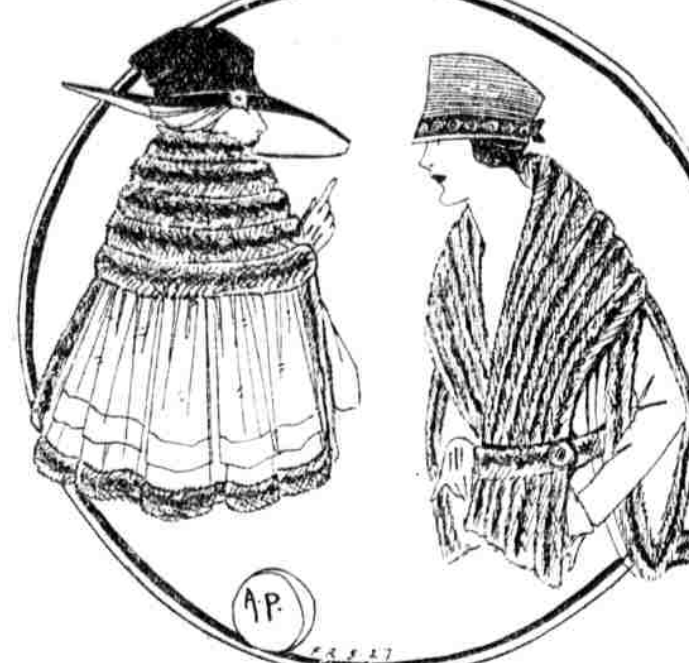
Two views of a particularly smart summer fur are shown in the sketch. The piece is in Georgette and follows the cape in the back and canteen in front.

It would take a very strong-minded woman this season to turn up her nose and call the summer furs ridiculous—furs that are certainly presented to us in all their glory of design and with the best in quality.