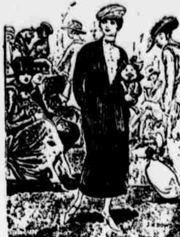
Pets in the park—edible and otherwise.

Very Bright "What is the difference between electricity and lightning?" "Lightning is free."