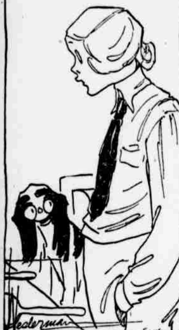
The young lady across the way says we can learn some valuable lessons even from our enemies and, while she understands that a good many of our soldiers gamble their money away as soon as they get it, she saw in the paper that the Germans had played their last card.