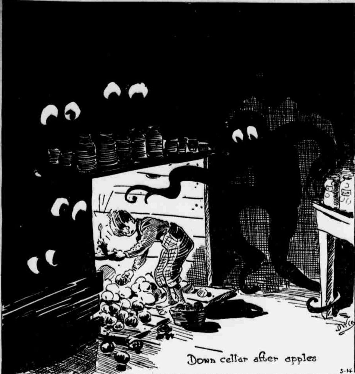
Down cellar after apples