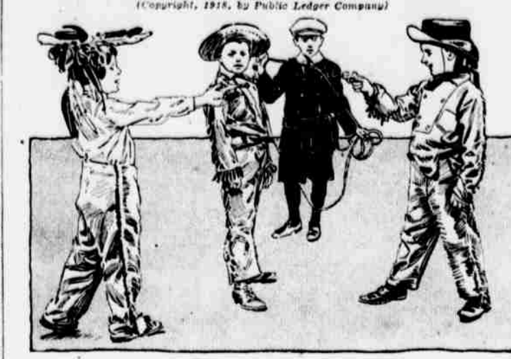
This is a period of capers and antics, the pinfeather period, the colt stage, the season of giggles and guffaws, the years of treasure islands and Indian camps

competitions with older boys and girls, long races, or high jumping, for the heart is not prepared for such strains. BARRED, CONTINUE 'WAR' By this age children are able to sit quietly for longer periods of mental work or handcrafts, but they also need lots of space for vigorous physical play, shouting and letting off steam generally,