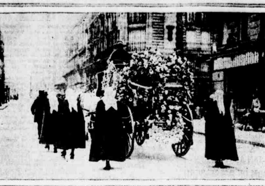
Before it was silenced by French gunners the long-range cannon which had been bombarding Paris succeeded in wrecking a nursery and added a nurse and a number of children to its list of victims.