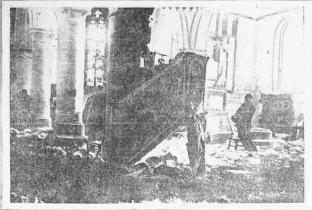
A lone Belgian worshiping in the remains of his cathedral in the war area. The photograph was taken by the

of fire ten shots on each range One of the Principal Forms of Diversion Was Horseback Riding in the Rear of the Battle-Pitted Fields and Roads or on the Dunes of the Belgian Coast-The "Blue