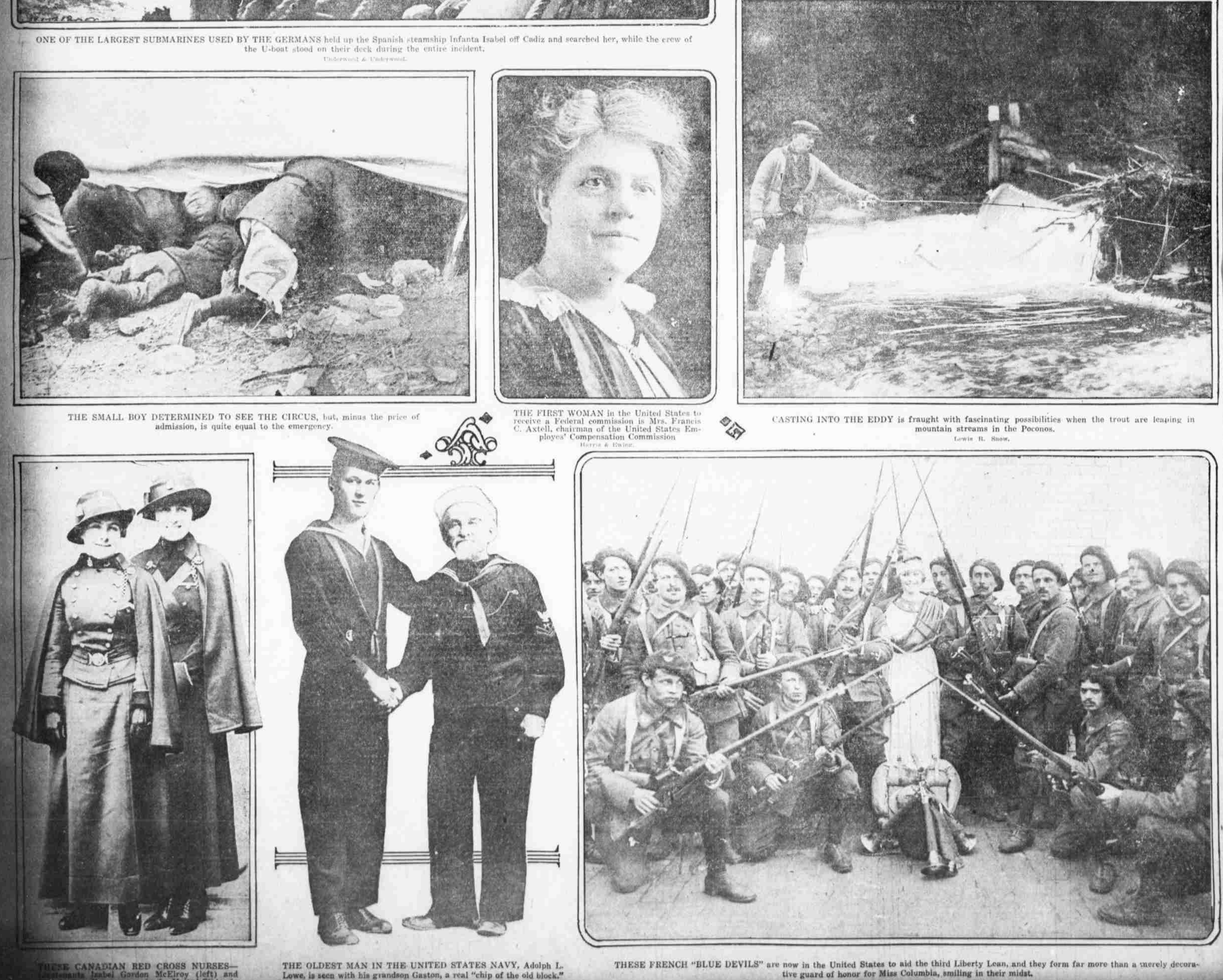
Committee on Public Information.