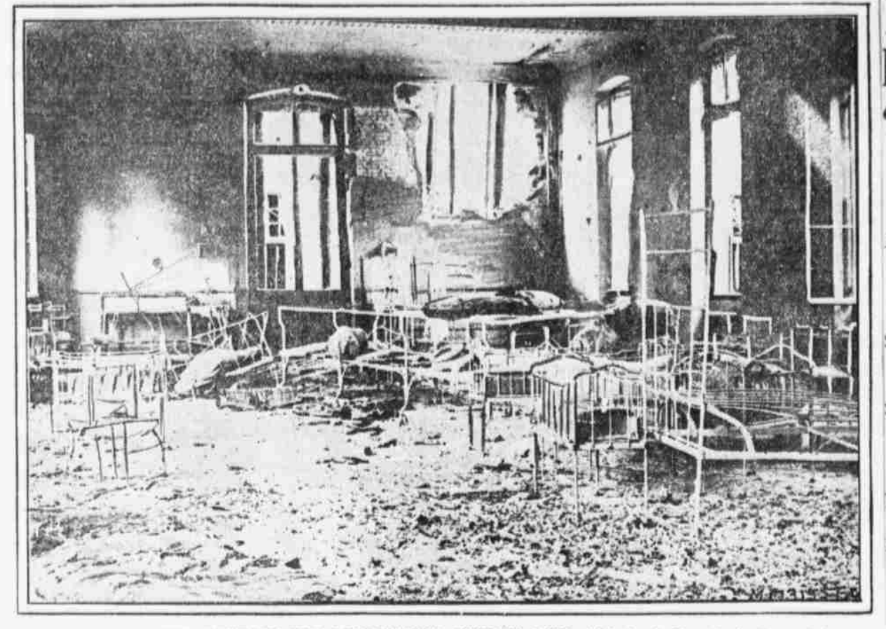
THE HAVOC WROUGHT BY THE LONG-RANGE GERMAN GUN which is shelling Paris from eighty miles away is illustrated in this blasted interior of a nursery.