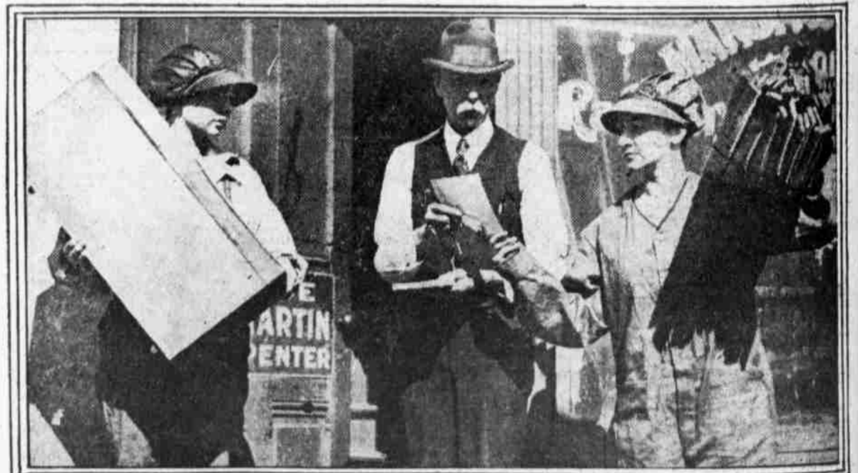
THE FEMALE OF THE SPECIES has again demonstrated her mechanical versatility, this time as carpenter, aiding her father.