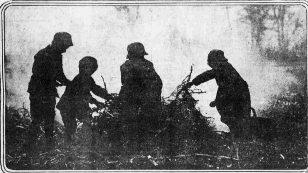
THE SPRINGTIME BONFIRE affords the small boy an ideal opportunity to play "Injun" and also get rid of accumulated winter rubbish.