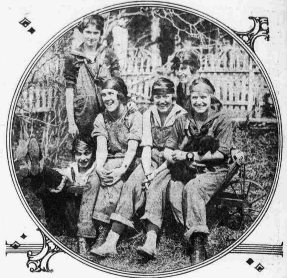
COLLEGE GIRLS by the hundred are taking to farm work as naturally and as gracefully as ever duck took to water.