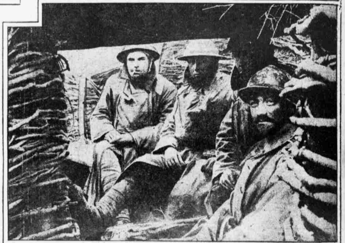
AMERICAN SOLDIERS AT THE FRONT have become thoroughly inured to life in the trenches, as the above picture shows.