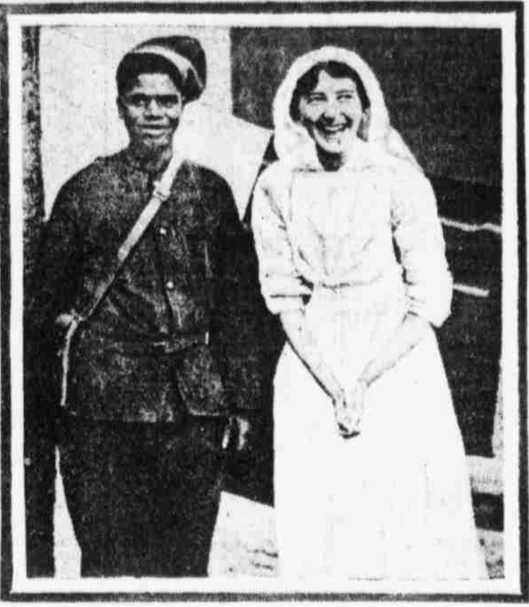
THE AUTHORESS AND A FRENCH TERRITORIAL.

I told you that in Furnes we nursed the French. That remark needs qualifying. Not only did we nurse the French, but among them were representatives from the French colonies, black, brown and yellow men. Great black, woolly-haired Senegals from East Africa, saucers and cannibals, lay stretched out on our beds, or often on the floor, for we were overflowing. These poor fellows could not even speak French, and they suffered bitterly from the cold.