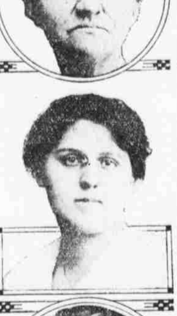
Portrait of a woman, likely related to the 'Deaths' section.

Deaths (continued) ... (List of names and dates of deaths)