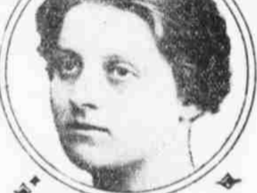
Portrait of a woman, likely related to the 'Deaths' section.

Deaths (continued) ... (List of names and dates of deaths)