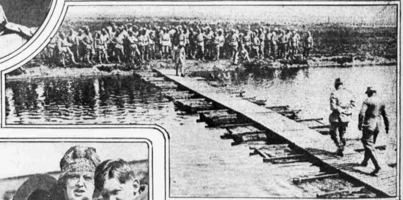
A NEW TYPE OF FOOTBRIDGE is being employed by French engineers in the Somme district. Cork floats replace the old-time cumbersome pontoons, and troop movement is vastly facilitated.