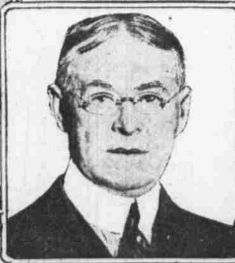
AFTER BIGGER LAURELS, Francis J. Heney, recent investigator of the Meat Trust for the Government, is out as gubernatorial candidate in California.