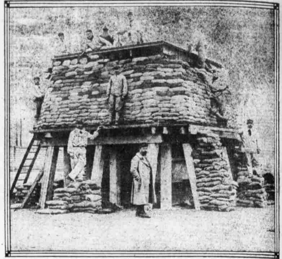
HEROIC MEASURES ARE BEING ADOPTED to protect the precious monuments of Paris against bombardment by the German long-range gun. French soldiers are placing sandbags around everything, from great churches to delicate marble columns.