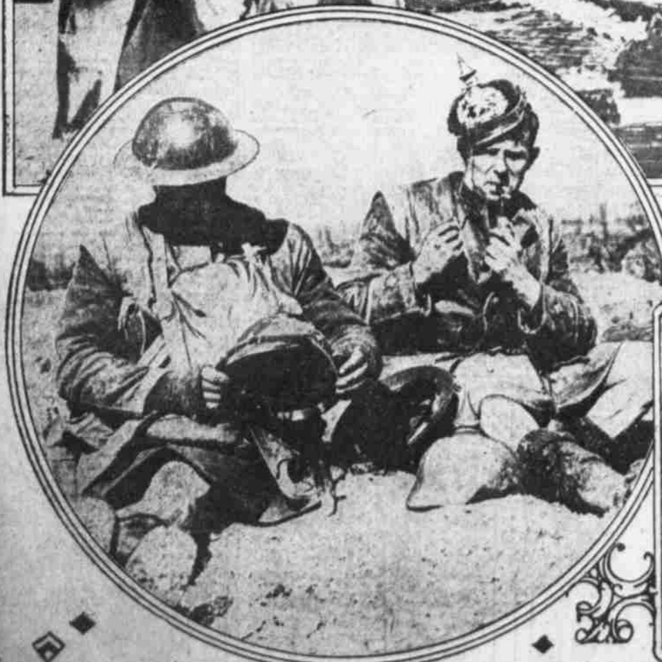
JOCK'S IRREPRESSIBLE SENSE OF HUMOR bubbles to the surface even when he is seriously wounded. These Highland laddies are happy, though wounded, because they have each bagged a German.