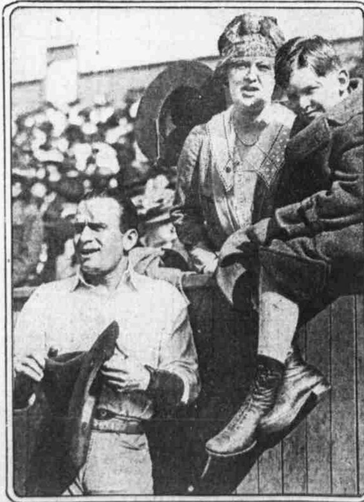
ALTHOUGH "SMILING DOUG" FAIRBANKS and his wife have separated "by mutual consent," no hint of the storm alleged to have shaken the movie star's domestic bliss is discoverable in this photograph, taken a short time ago.