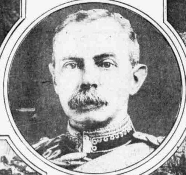
THE BRITISH COMMANDER ON the Flanders front is General Herbert O. C. Plumer, who has been brought back from Italy.