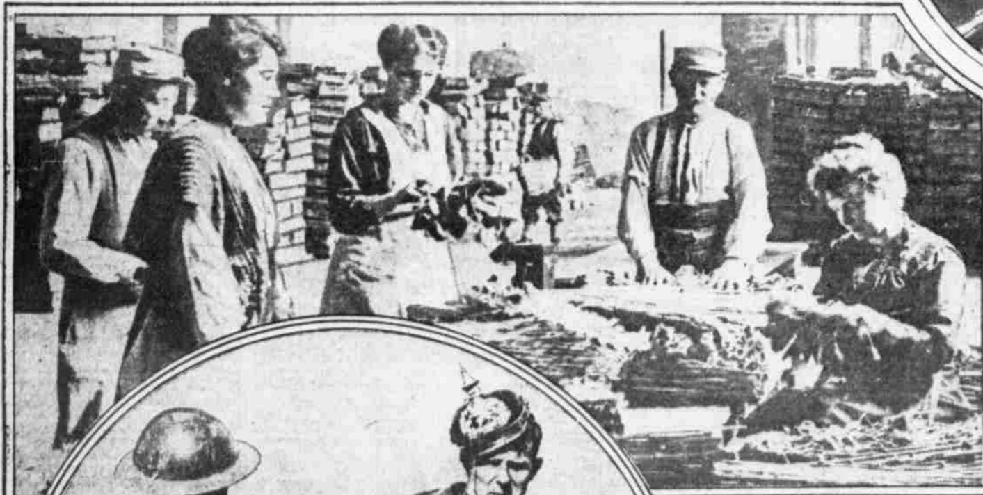
PACKING VEGETABLE PLANTS for farmers in the reconquered portion of France engages the attention of many workers at the National Nurseries at Versailles.