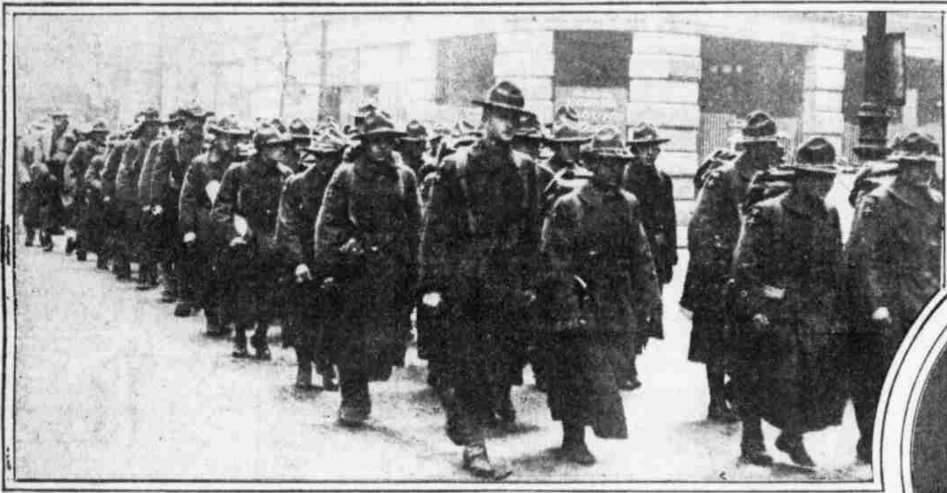
THROUGH LONDON TO THE FIGHTING FRONT are marching the sturdy nephews of Uncle Sam by thousands and tens of thousands these days. The above scene has become a commonplace in the British capital as the "boys from the States" stretch their legs after their voyage across the Atlantic. The system of pack carrying that has been adopted is shown.