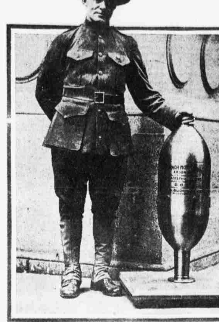
Among the means of stimulating the interest of citizens at the Liberty Statue is this trench-mortar bomb in the custody of a marine.

The Camden National Bank has taken subscriptions totaling a half million dollars and the bank's own subscription to the third loan has not yet been made.