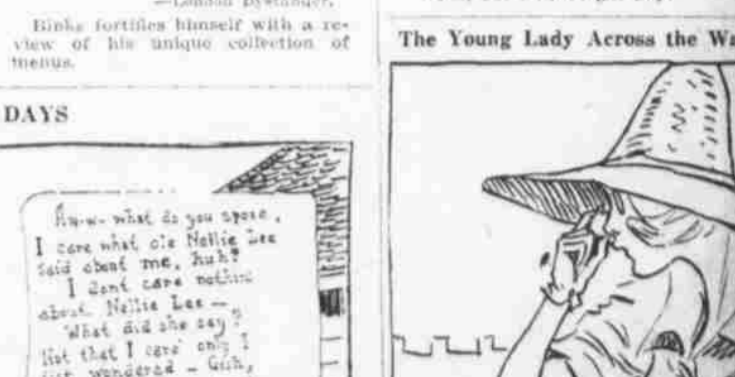
The Young Lady Across the Way

War Rations Entirely Different Things Did you ever play cards for money? Yes, but I never got any.