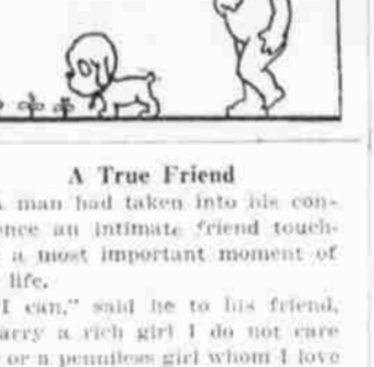
A True Friend

THE CHEERFUL CHERUB The springtime stirs And through it green shoots bravely start. In spring through all my last year's loves A new love sprouts within my heart.