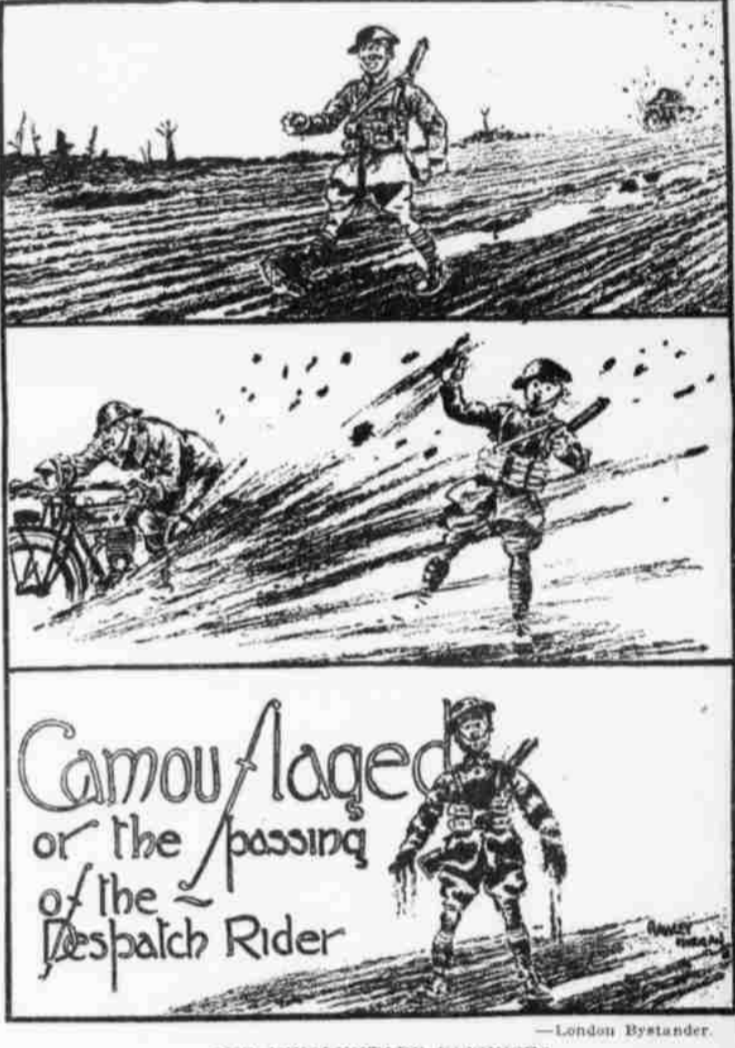
OUR INVOLUNTARY DISGUISES

War Rations Entirely Different Things Did you ever play cards for money? Yes, but I never got any.